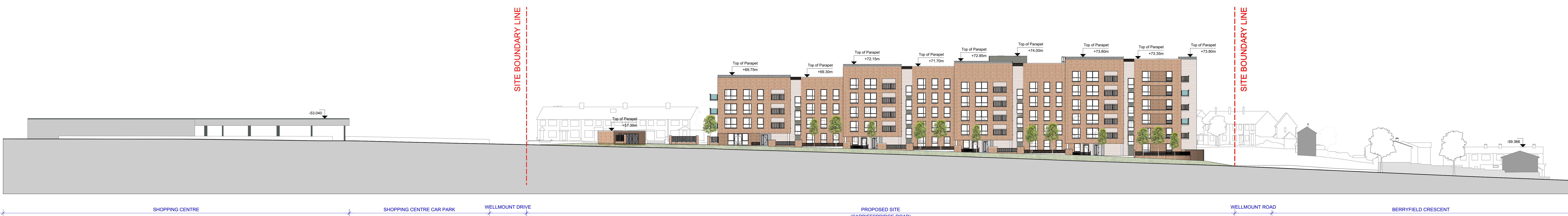
2 Contiguous Site Elevation - Proposed Scale: 1:300