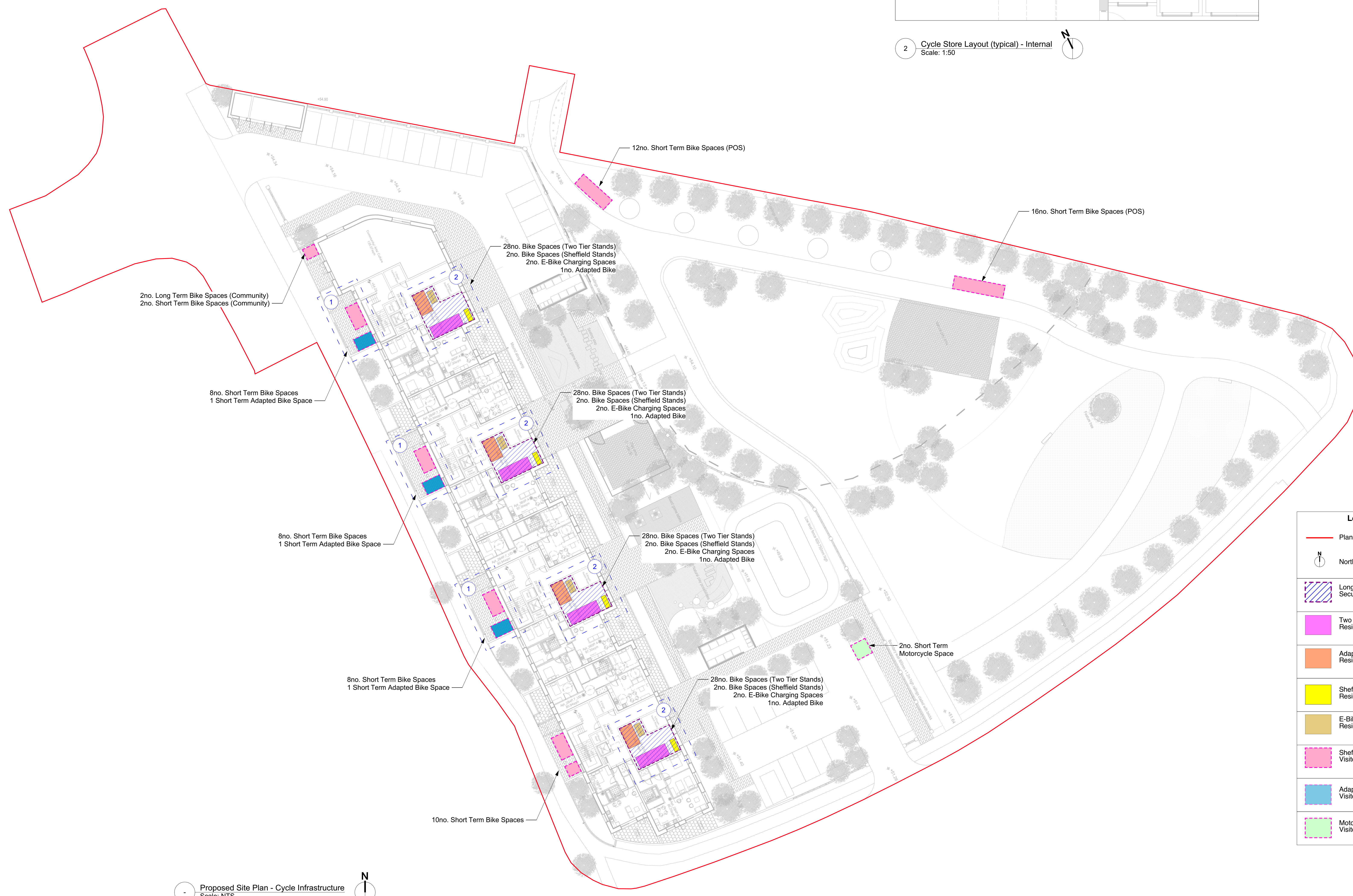
Proposed Site Plan - Cycle Infrastructure Scale: NTS