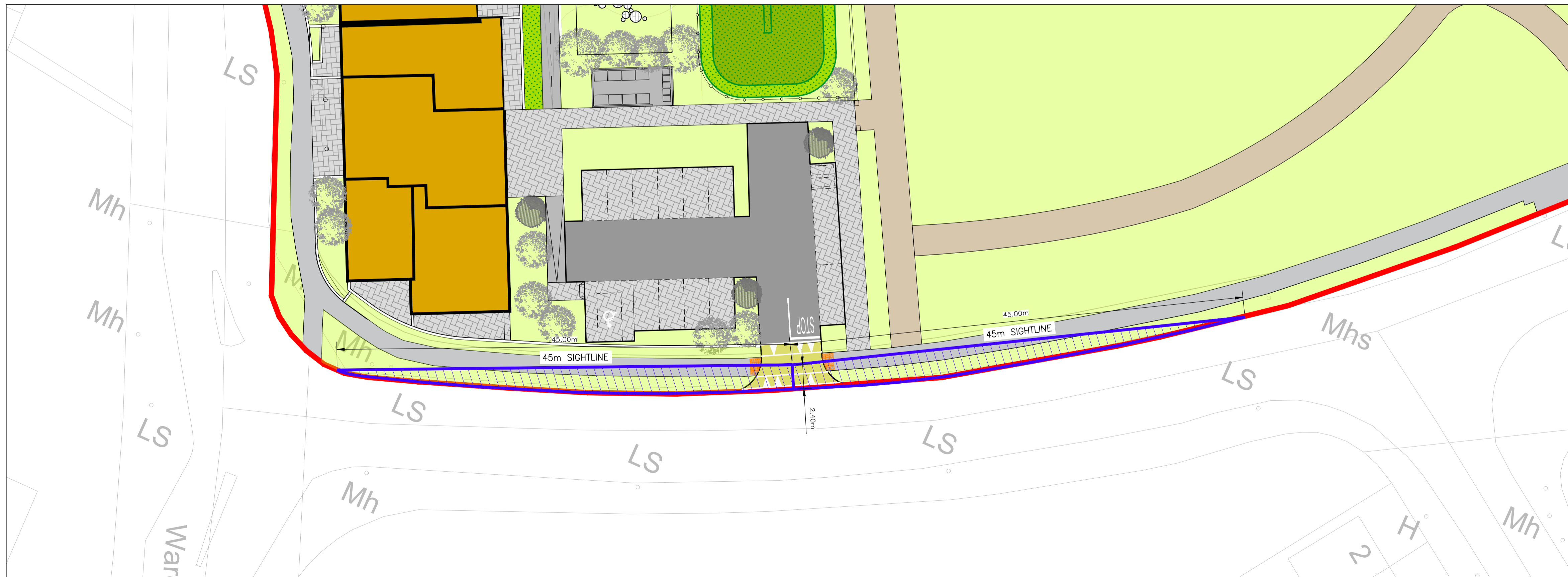
PLAN OF SIGHTLINES FOR JUNCTION WITH WELLMOUNT ROAD SCALE 1:250