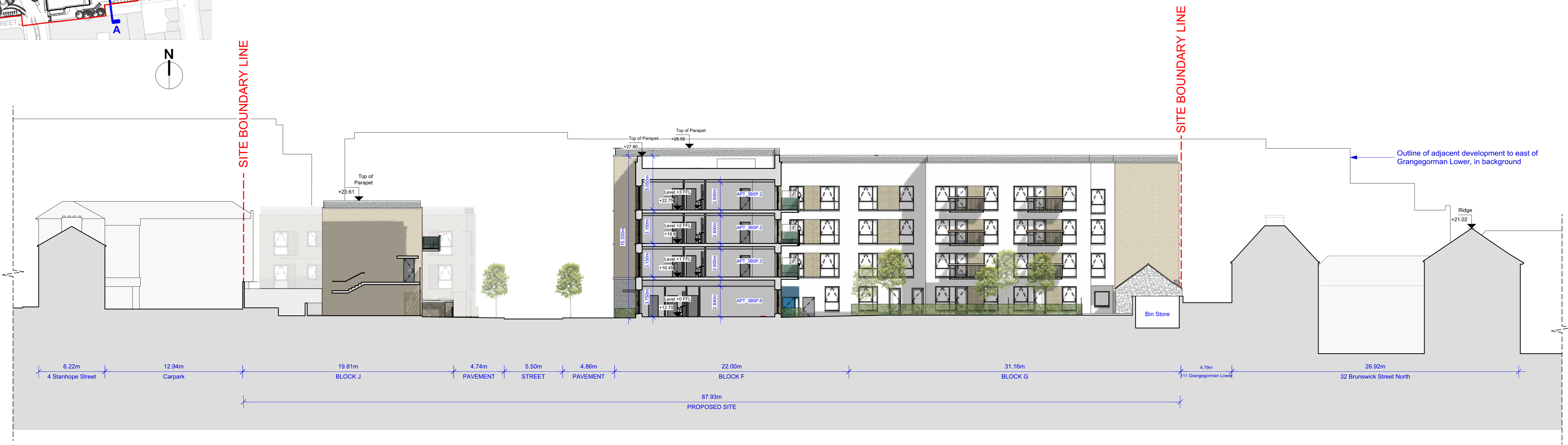
1 Site Section - A Scale: 1:200