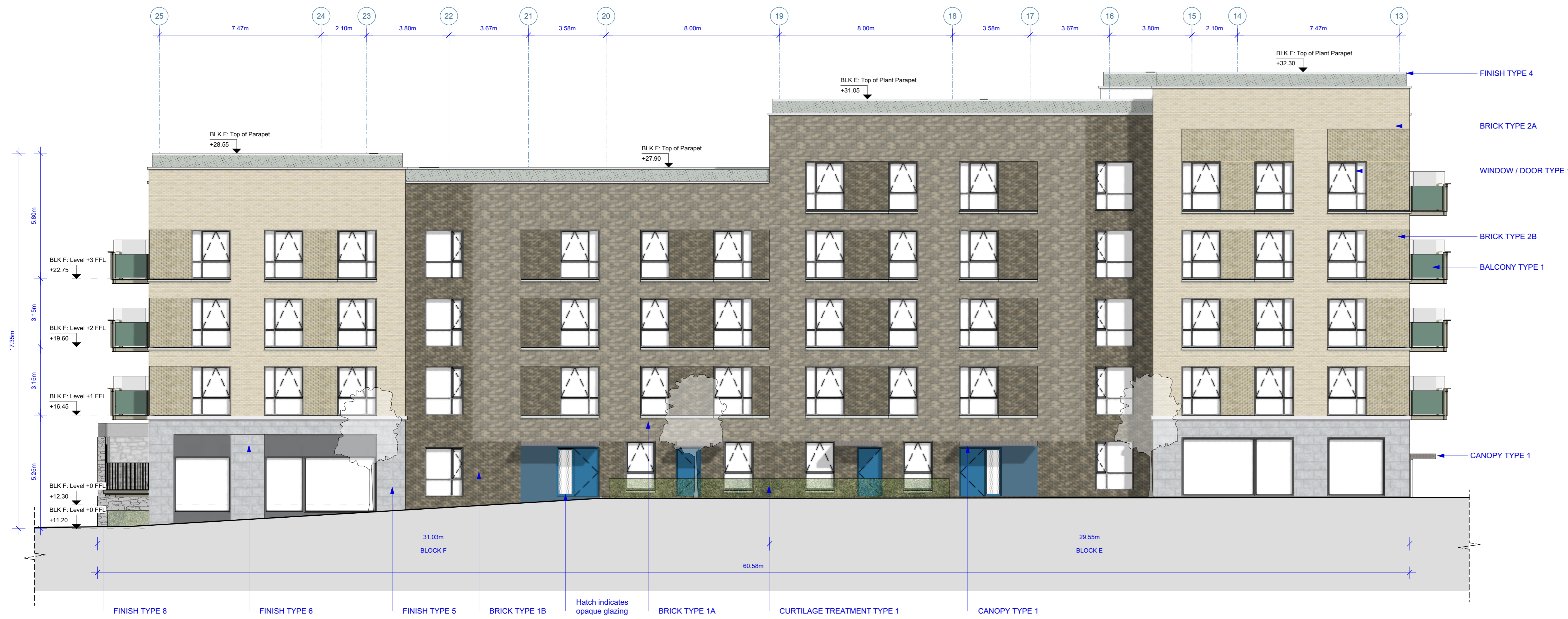
1 Building 2 - North Elevation Scale: 1:100