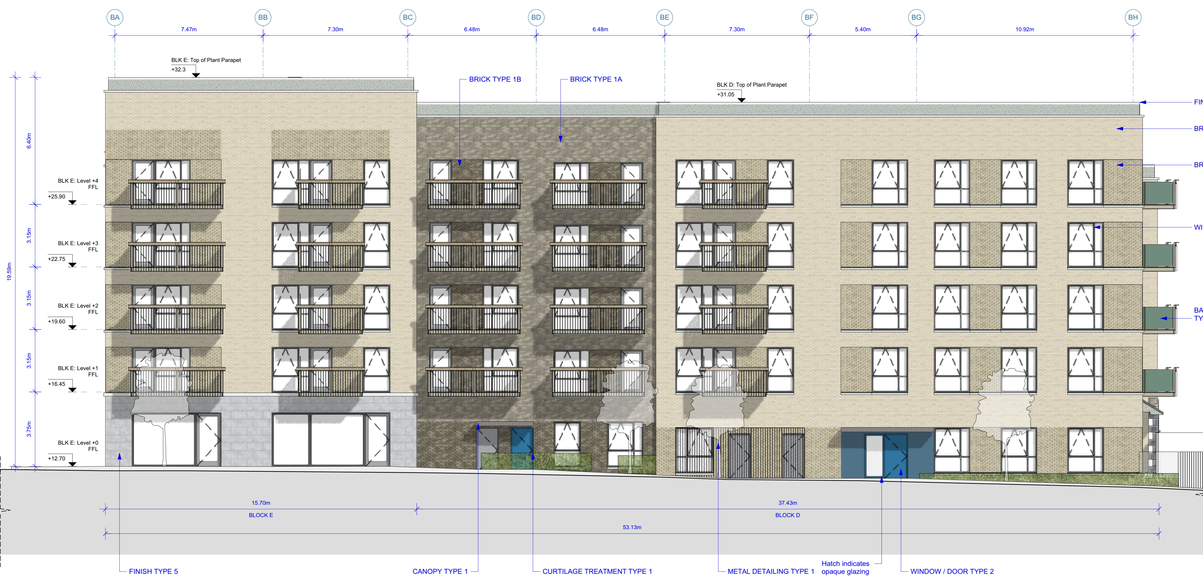
2 Building 2 - West Elevation Scale: 1:100