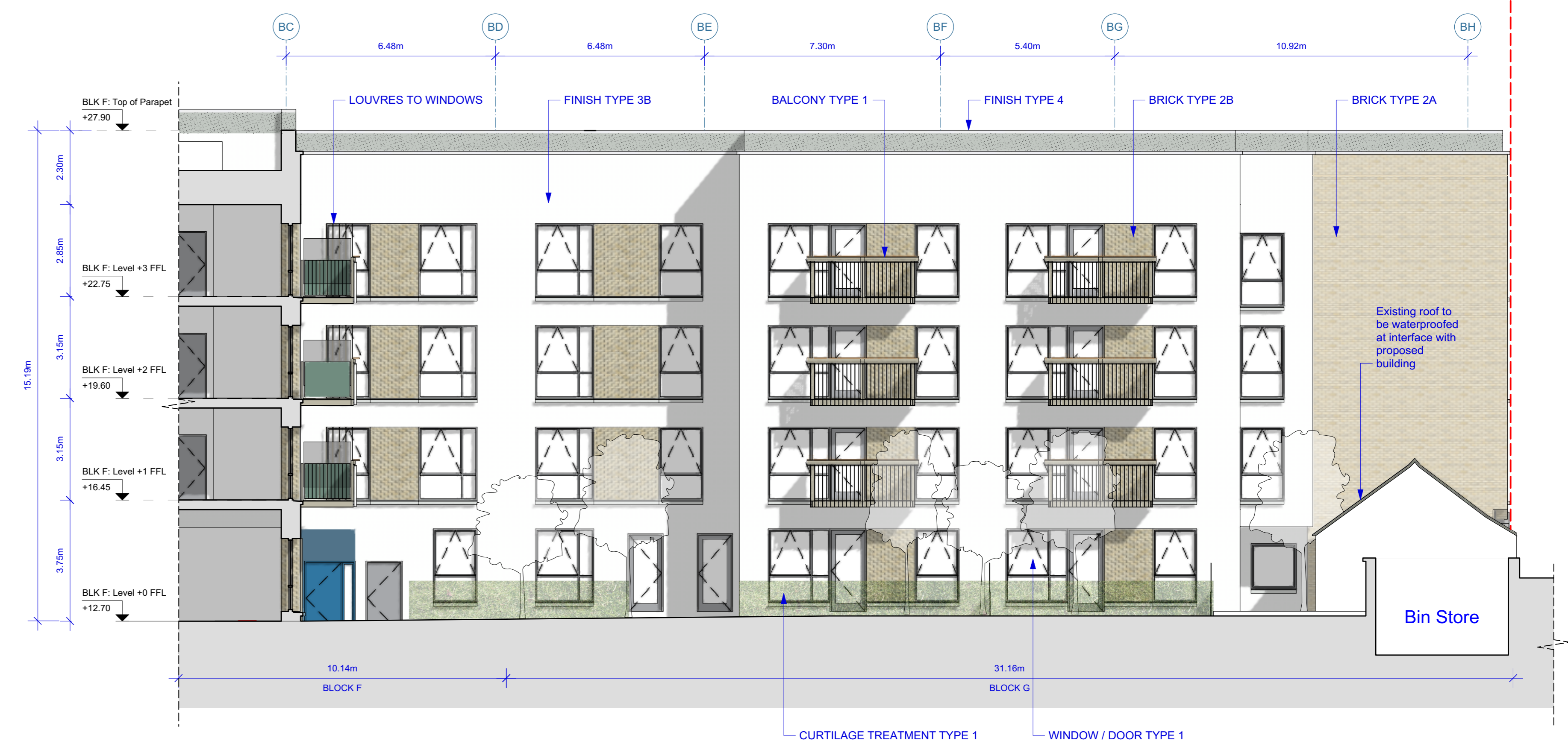
3 Building 2 Internal Courtyard Elevation - West Elevation Scale: 1:100