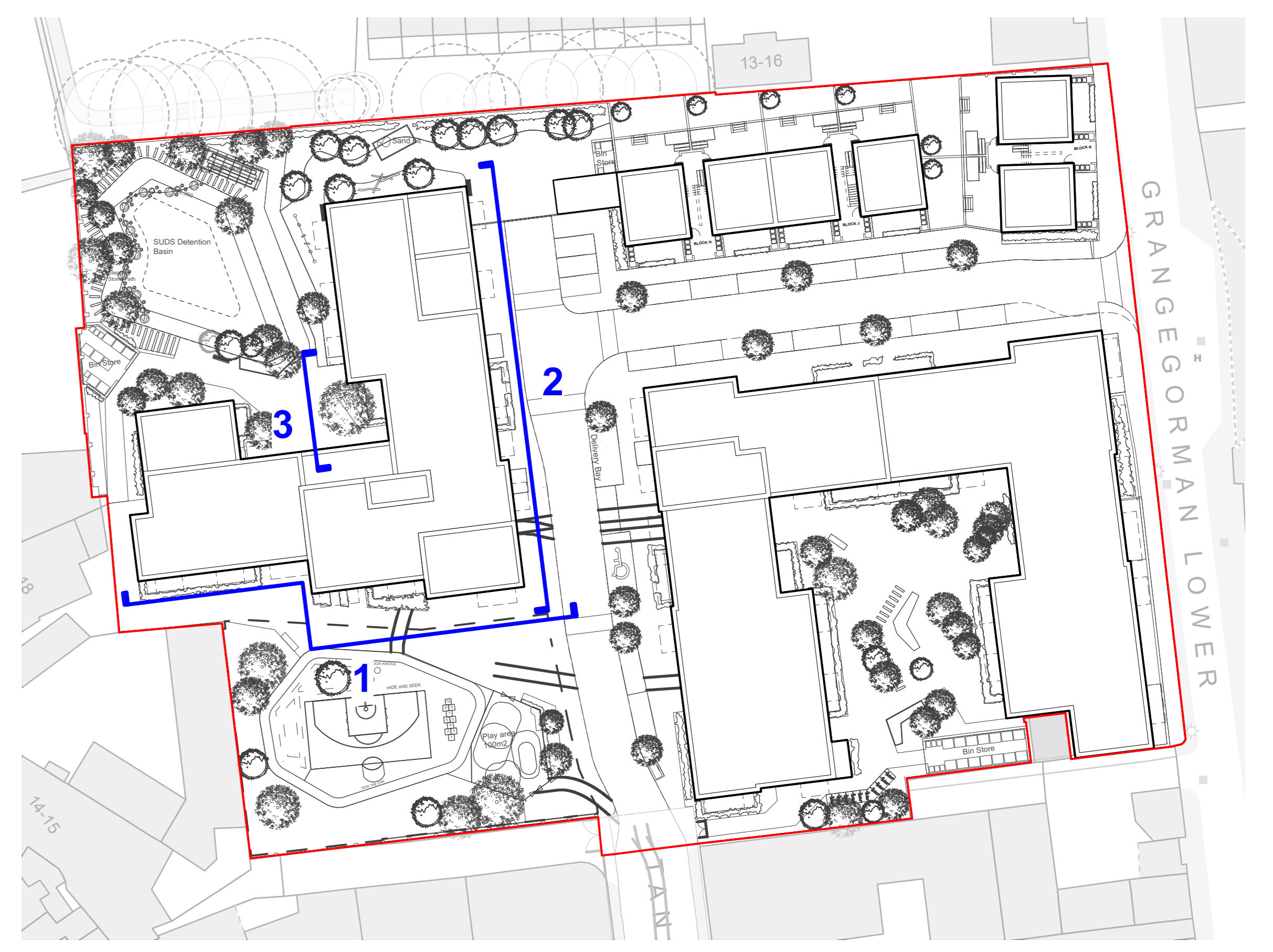
4 Key Plan Scale: 1:500