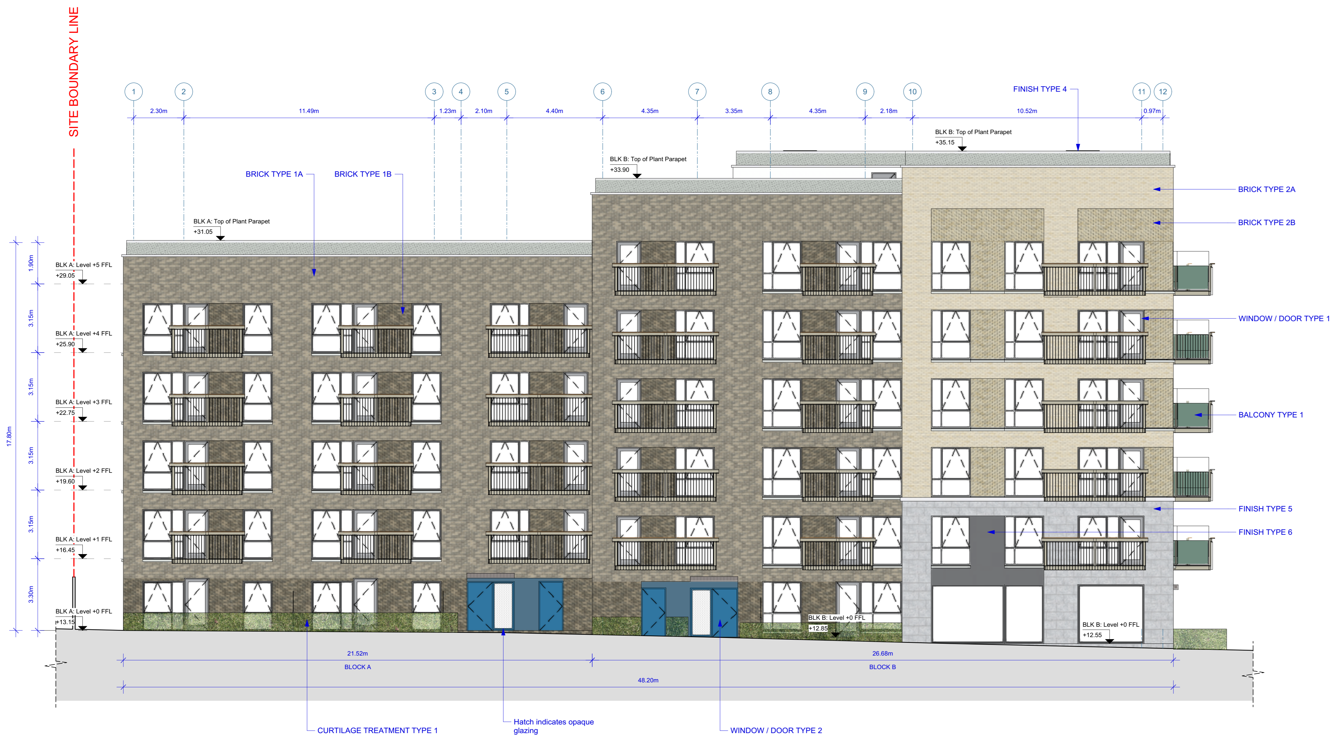
1 Building 1 - South Elevation Scale: 1:100