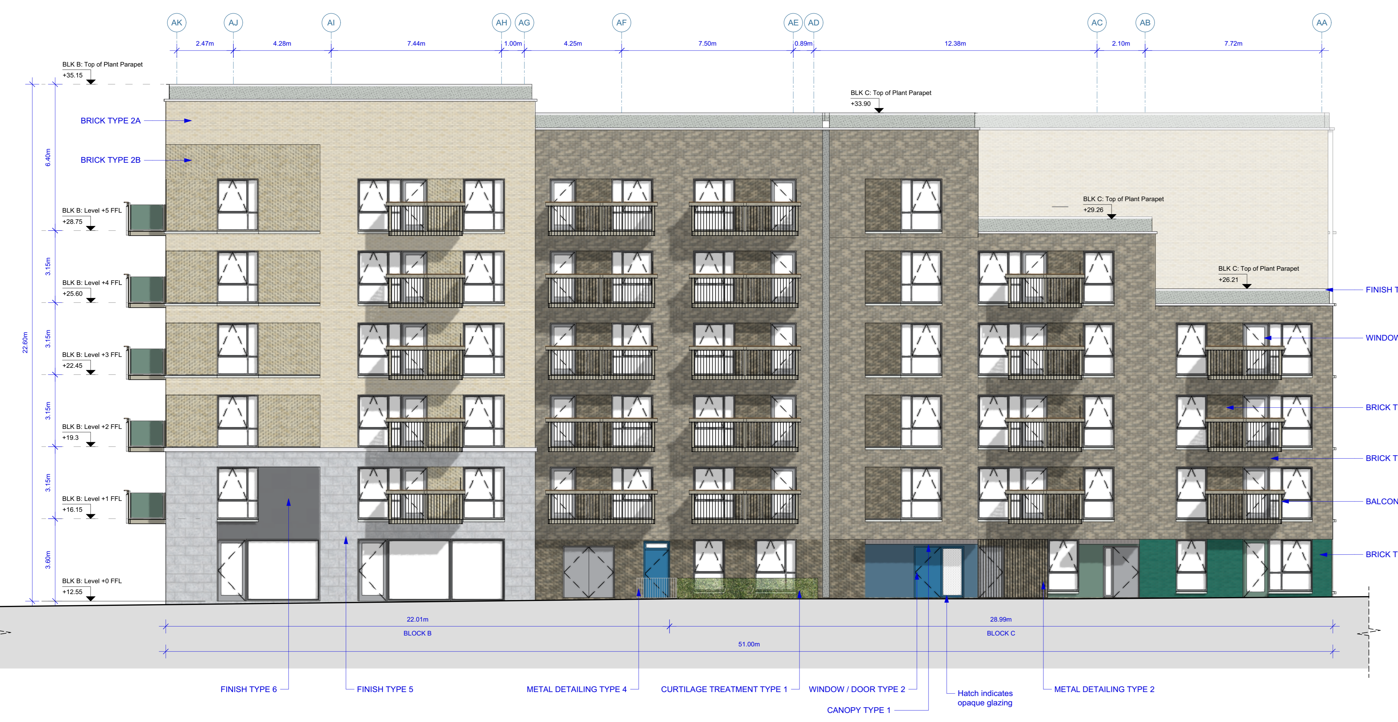
2 Building 1 - East Elevation Scale: 1:100