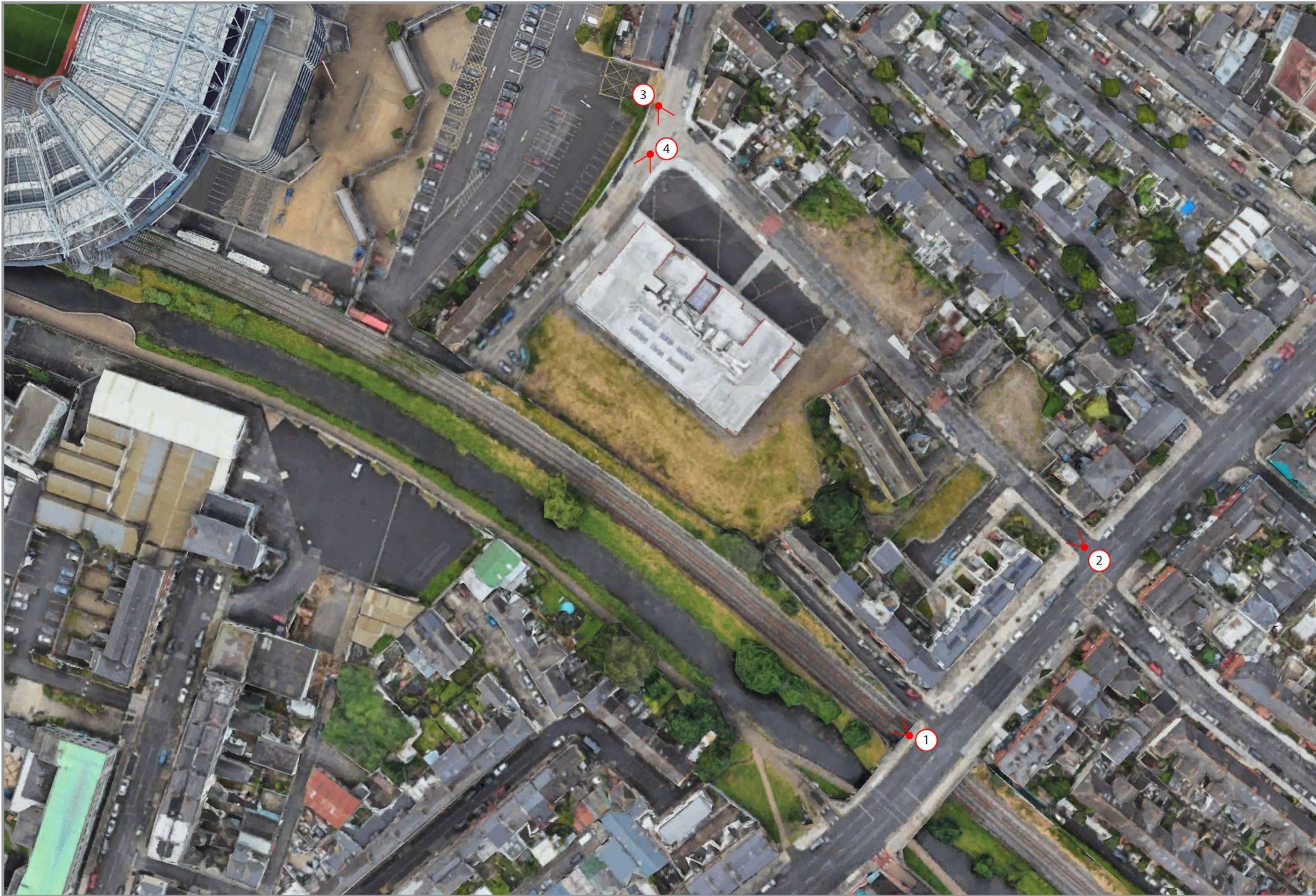
View Location Map

This map is for view location purposes only. Please refer to Architects drawings for site layout and redline boundary.