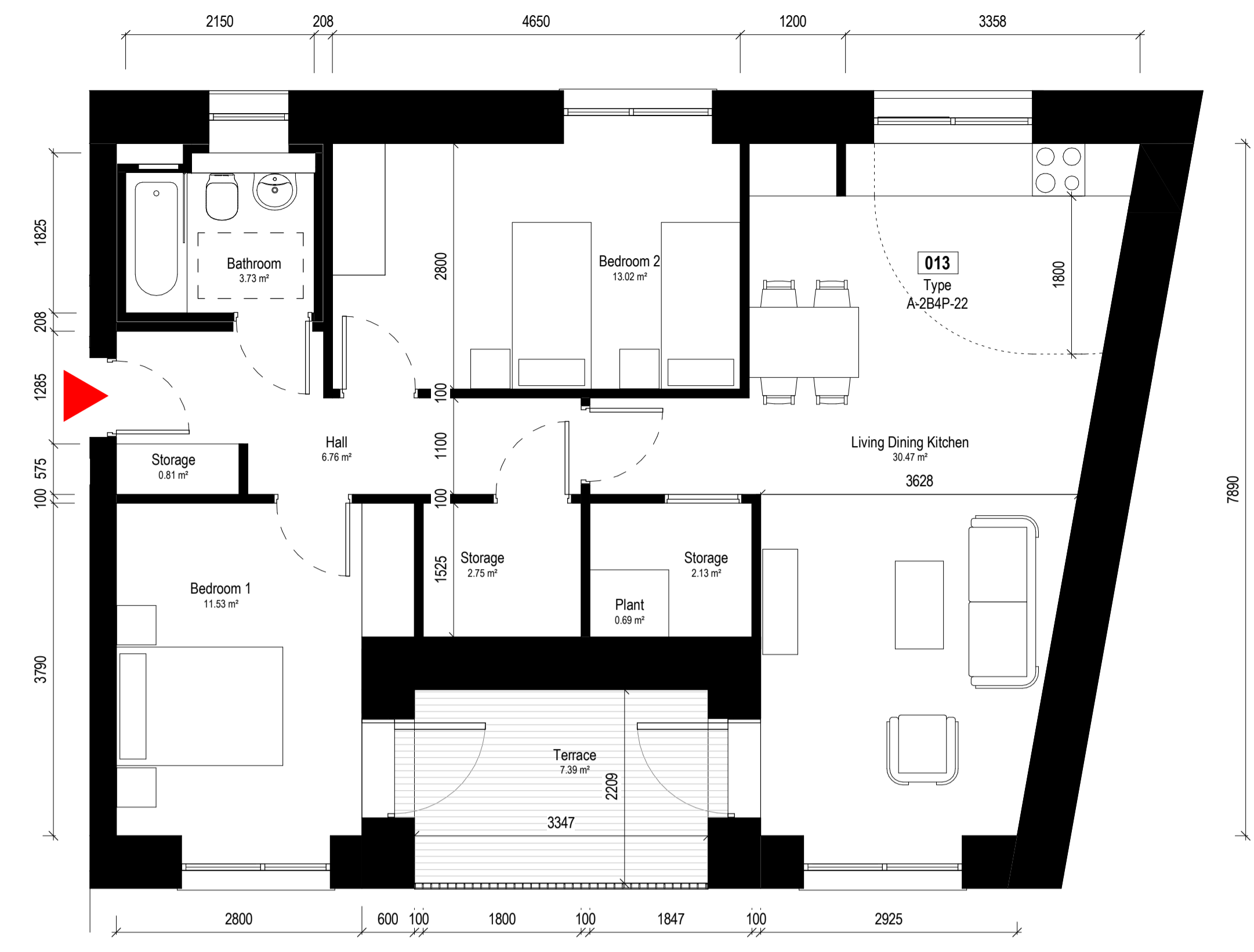
2 Type A-2B4P-22 1:50