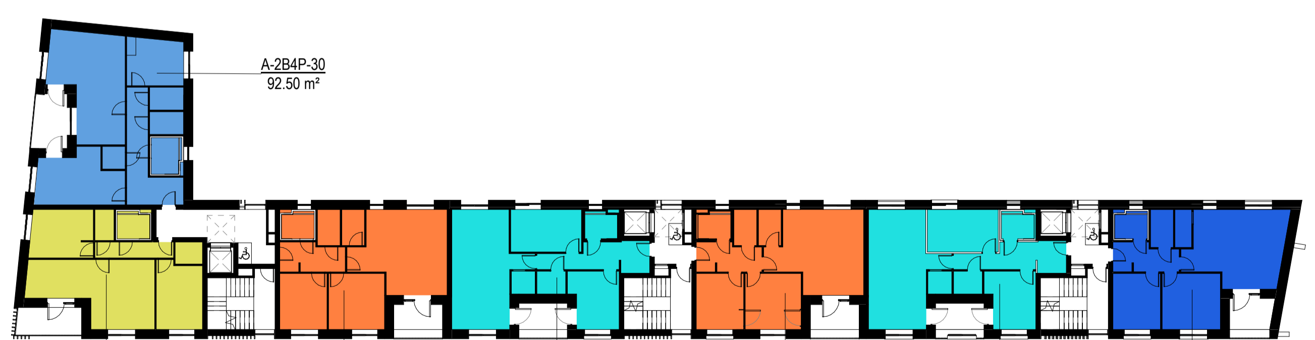
5 Block A - Fourth Floor Area Plan 1:250