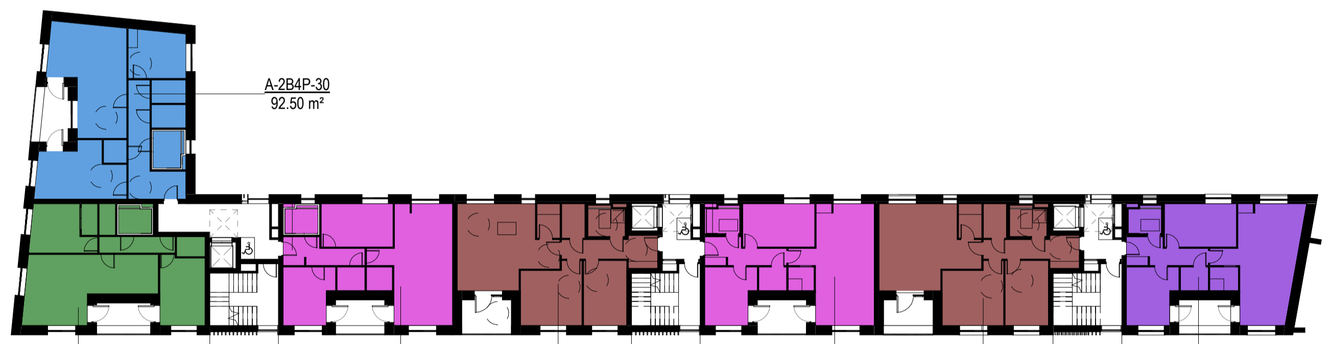
4 Block A - Third Floor Area Plan 1:250