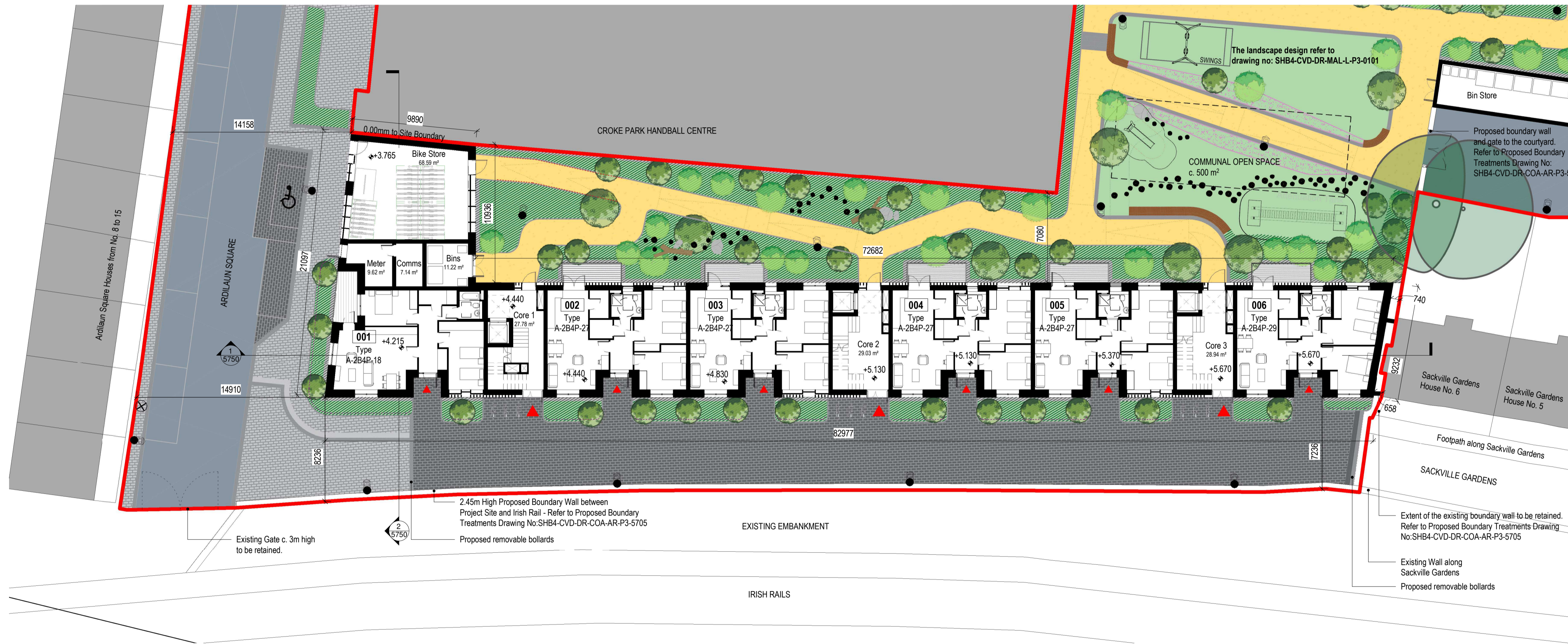
1 Block A-GA-Ground Floor Plan 1:200