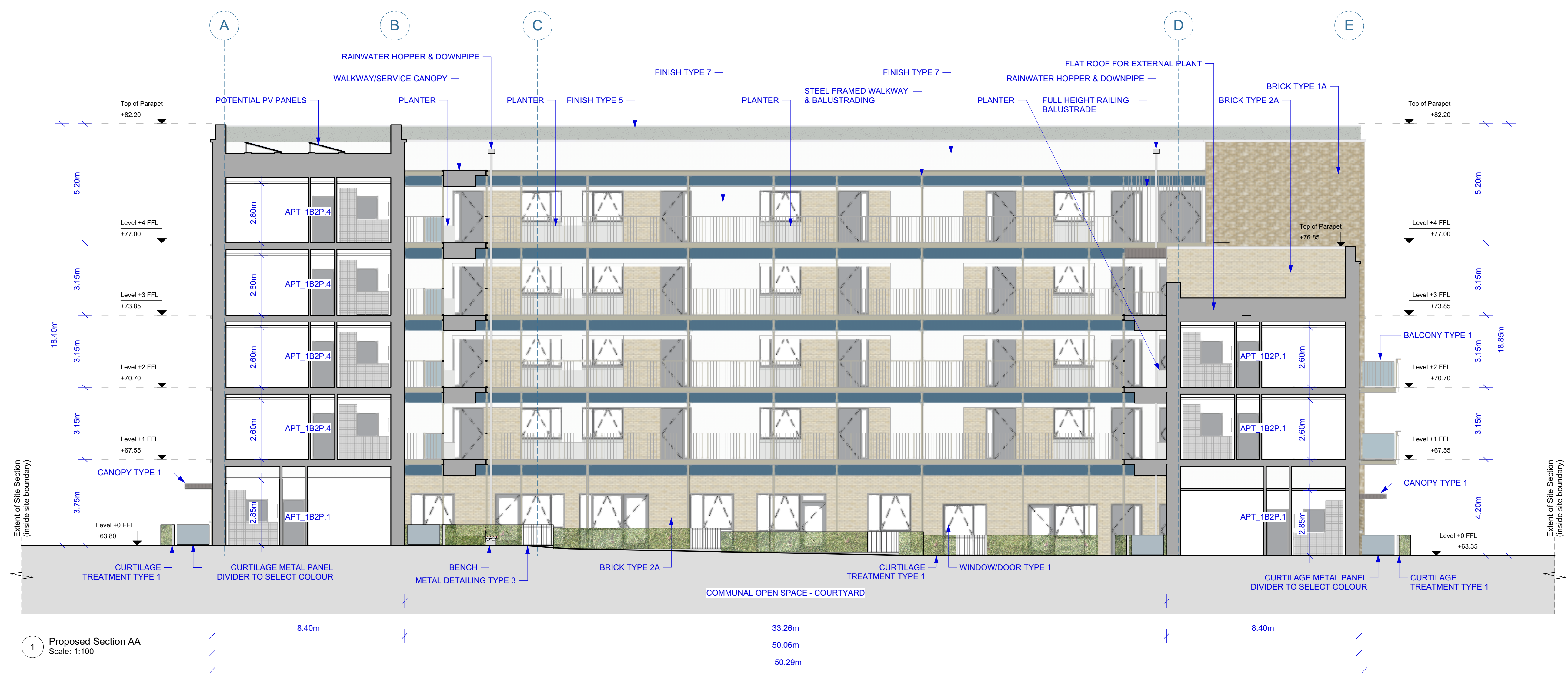
1 Proposed Section AA Scale: 1:100