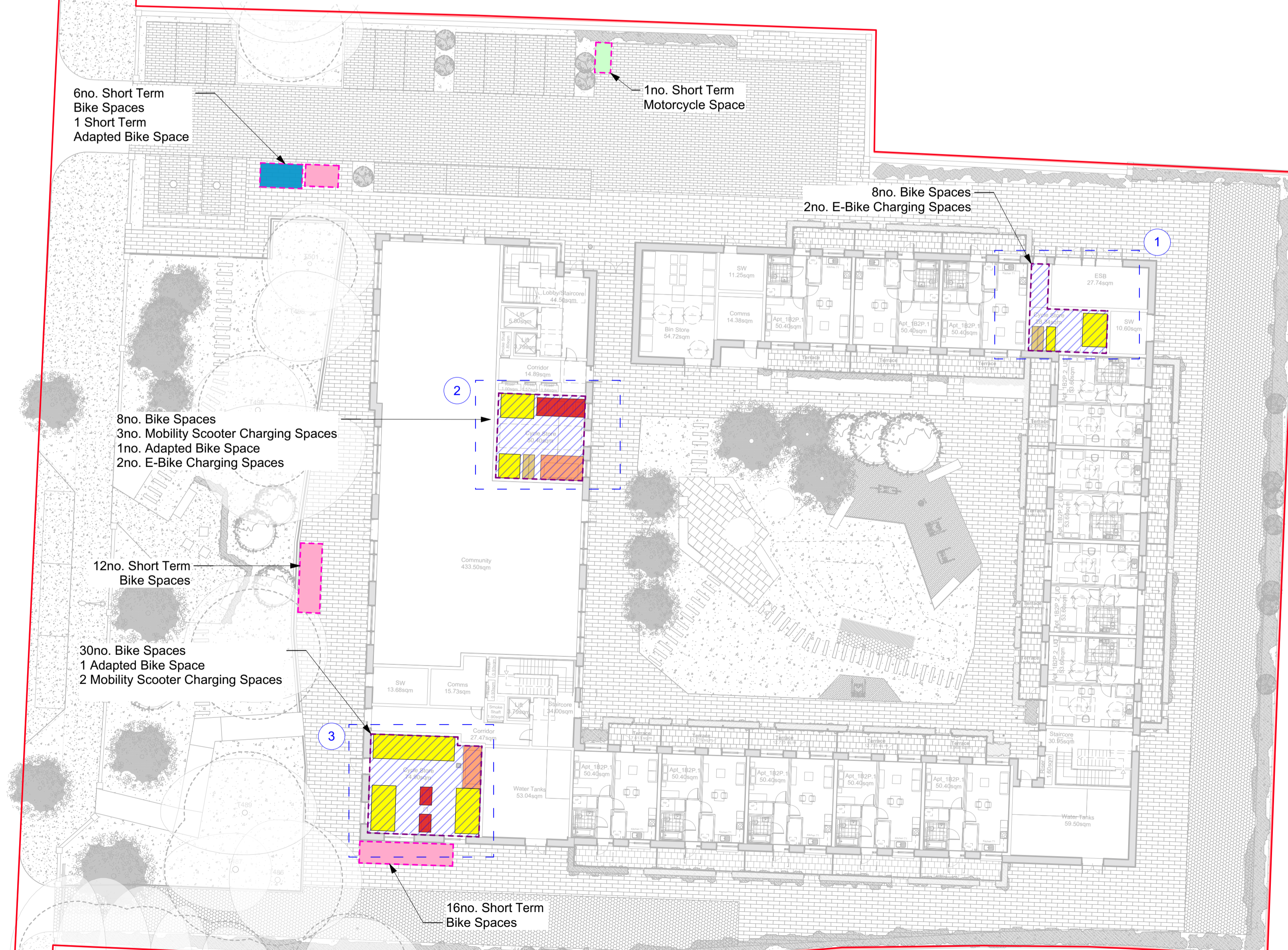
4 Proposed Site Plan - Cycle Infrastructure Scale: NTS