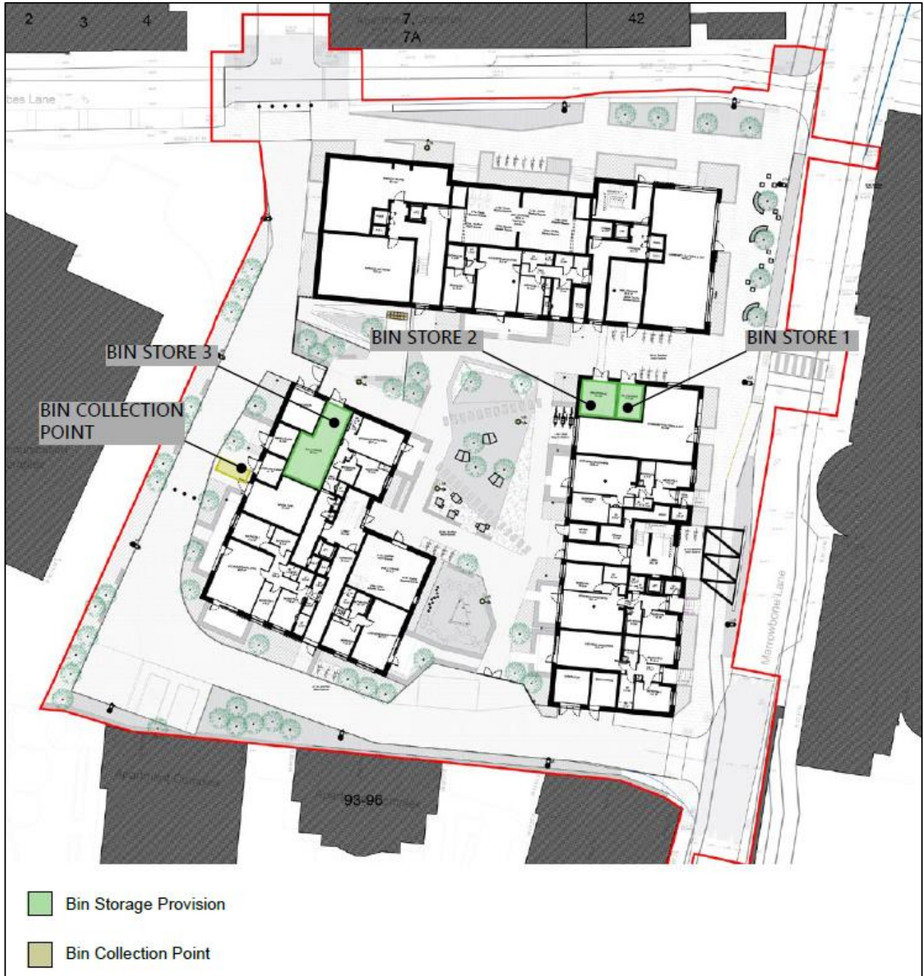
Figure 1.0 Waste Storage Areas