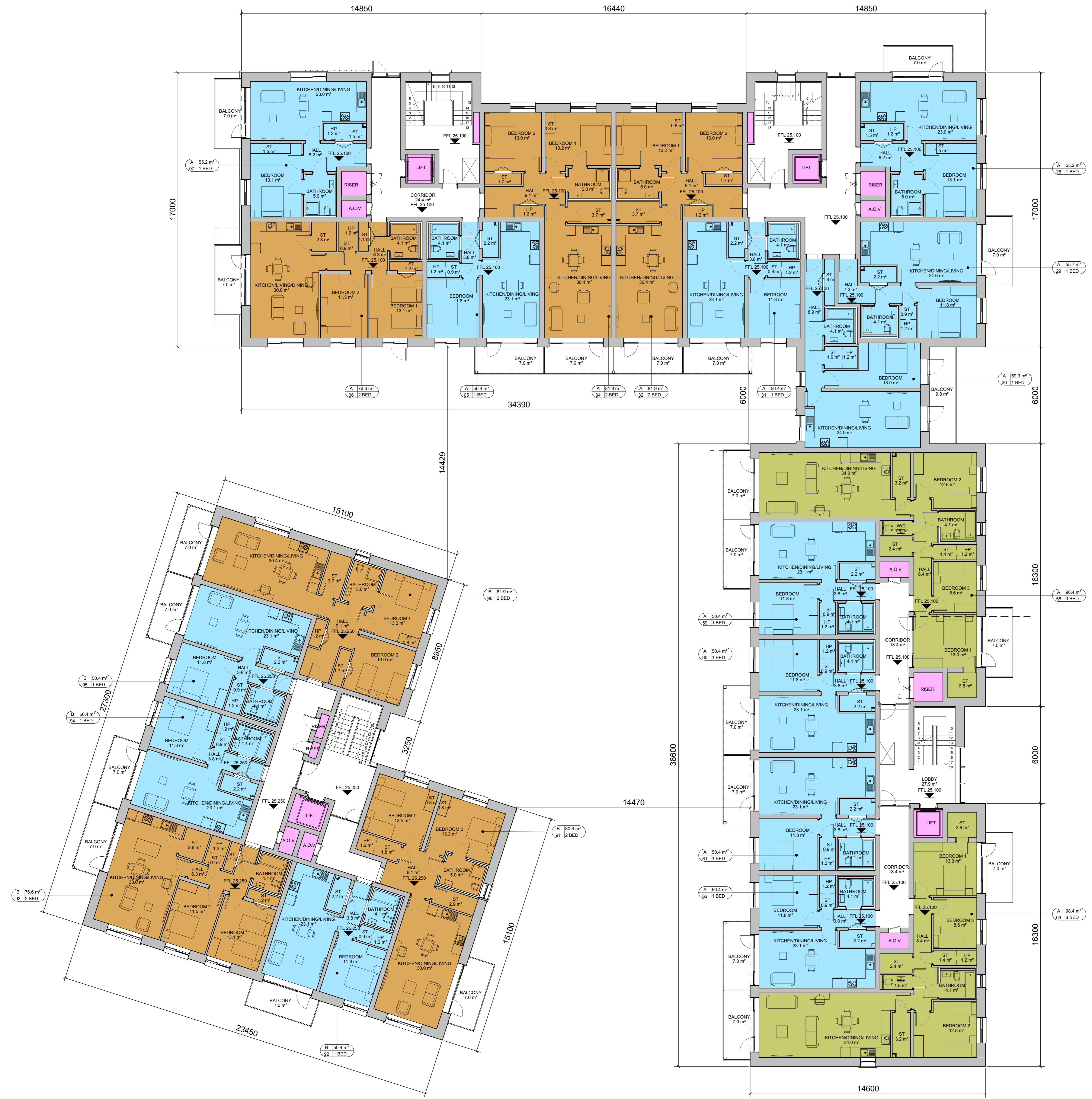
02-SECOND FLOOR SCALE: 1: 100