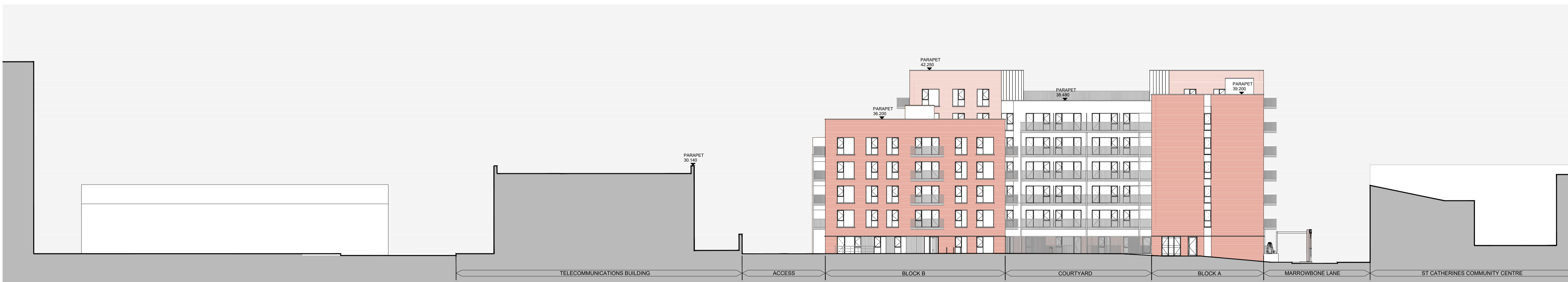
CONEXT ELEVATION D-D 1:250