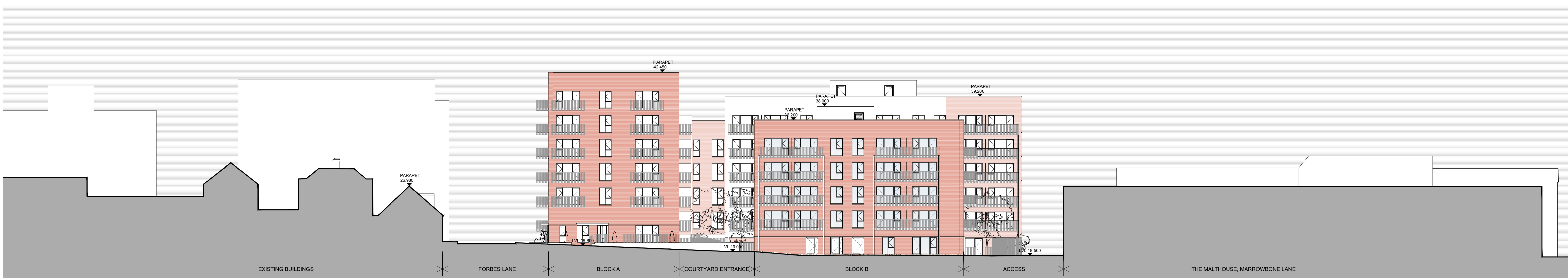
CONEXT ELEVATION C-C 1:250

THIS DRAWING TO BE READ IN CONJUNCTION WITH ALL ARCHITECT'S DRAWINGS, SPECIFICATIONS CONSULTANTS DESIGN TEAM DRAWINGS AND SPECIFICATIONS.