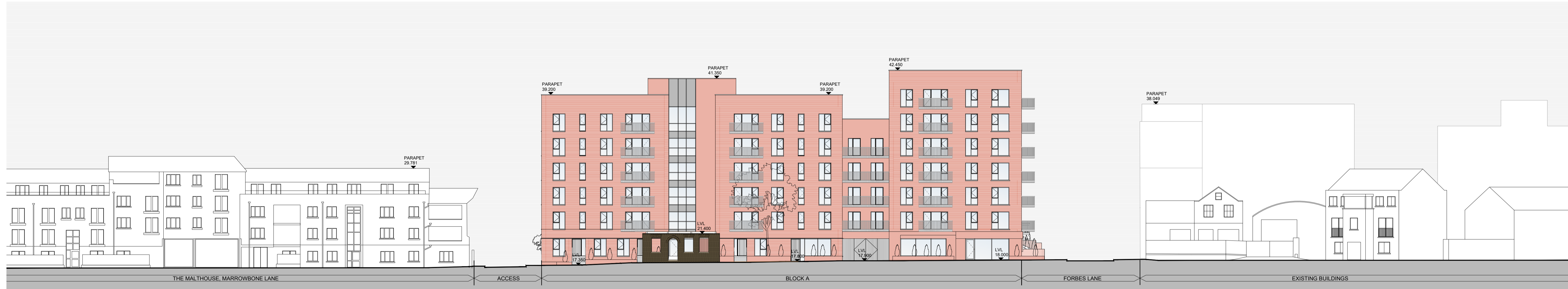
CONEXT ELEVATION A-A 1:250

THIS DRAWING TO BE READ IN CONJUNCTION WITH ALL ARCHITECT'S DRAWINGS, SPECIFICATIONS CONSULTANT'S DESIGN TEAM DRAWINGS AND SPECIFICATIONS.