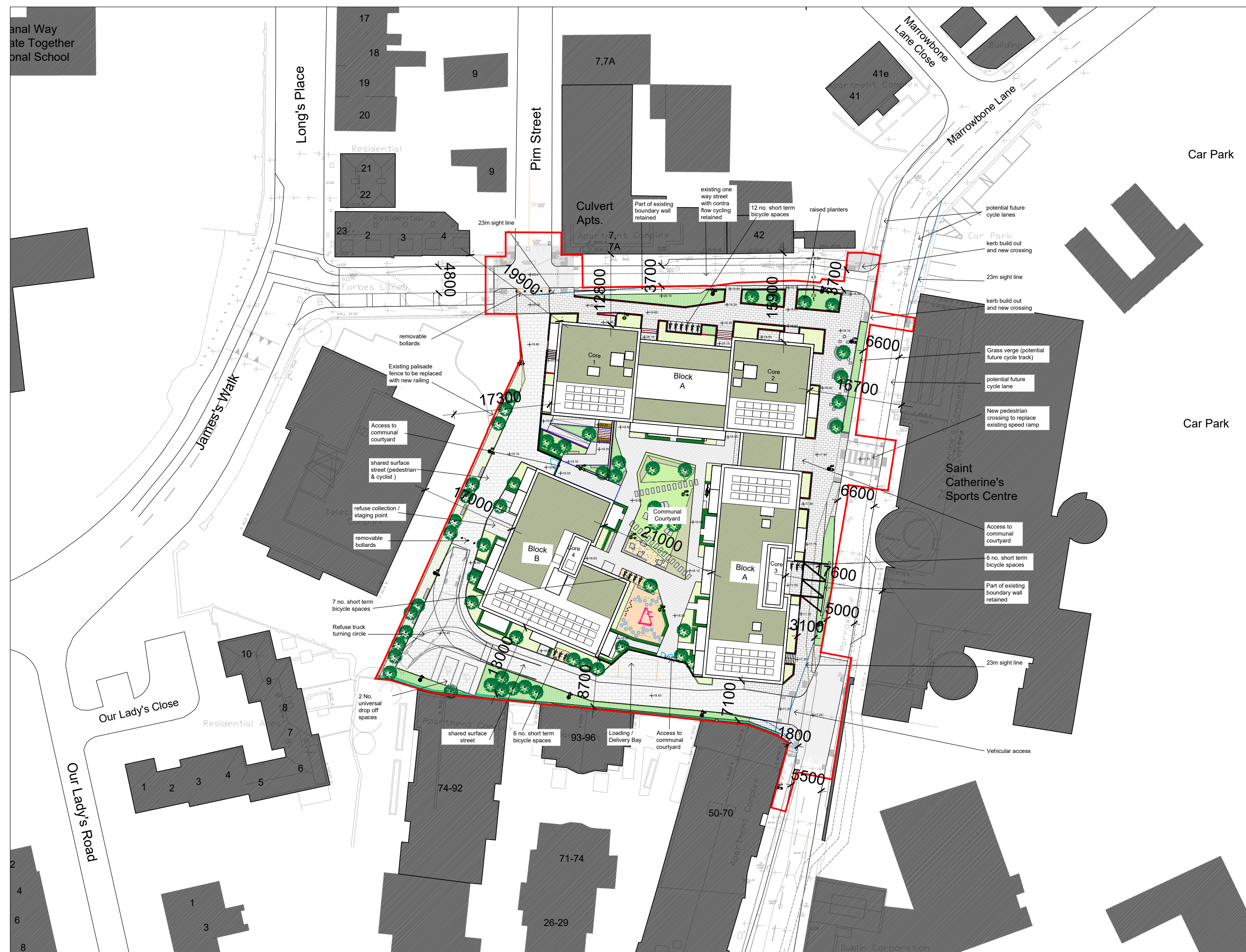
Proposed Site Plan - 1:500