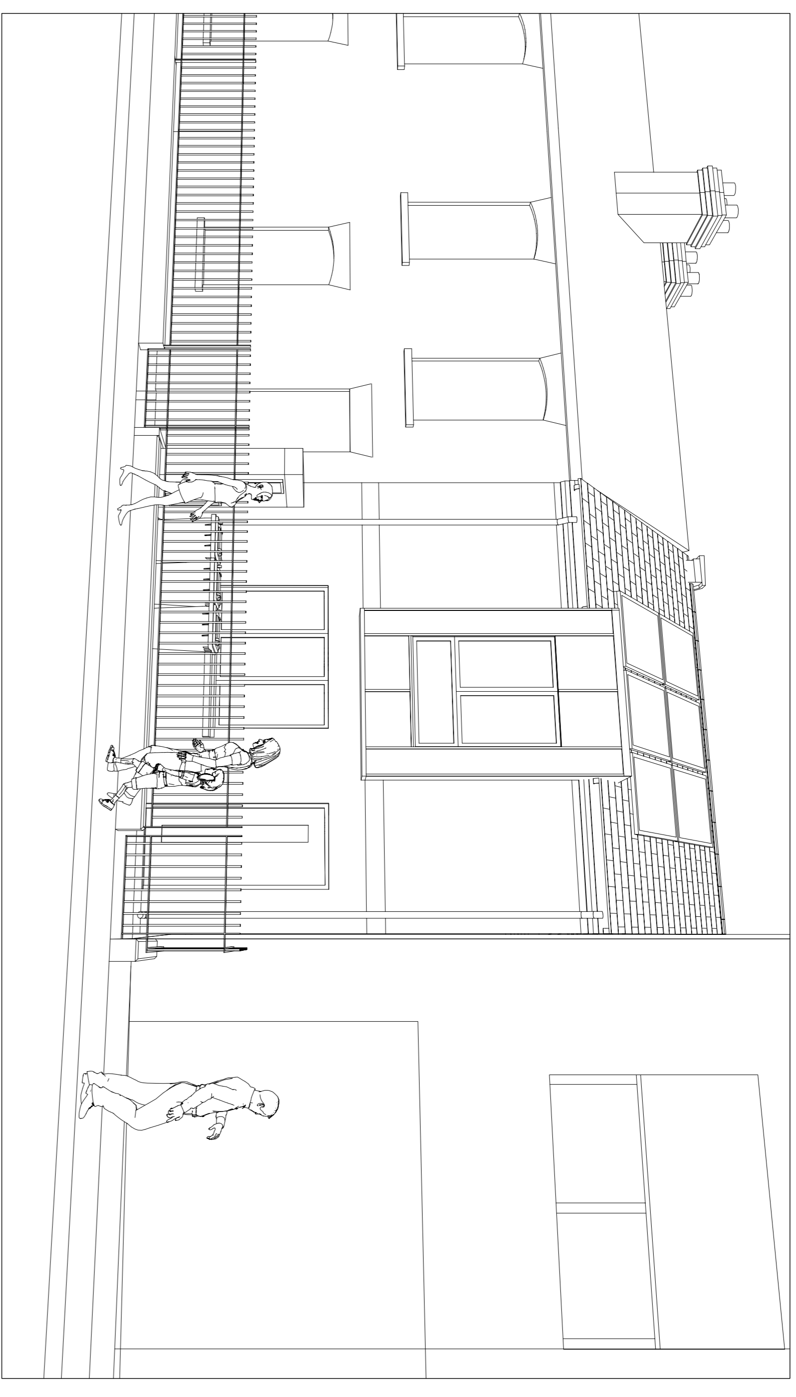
VIEW SHOWING ENTRANCE