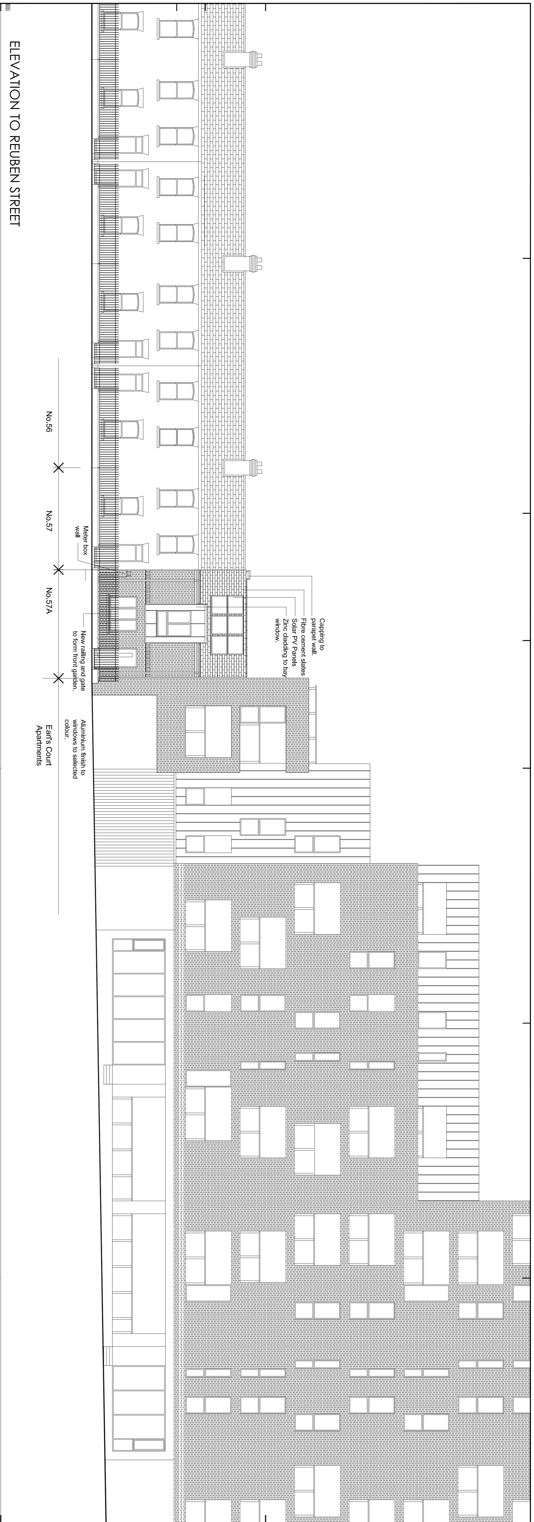
ELEVATION TO REUBEN STREET