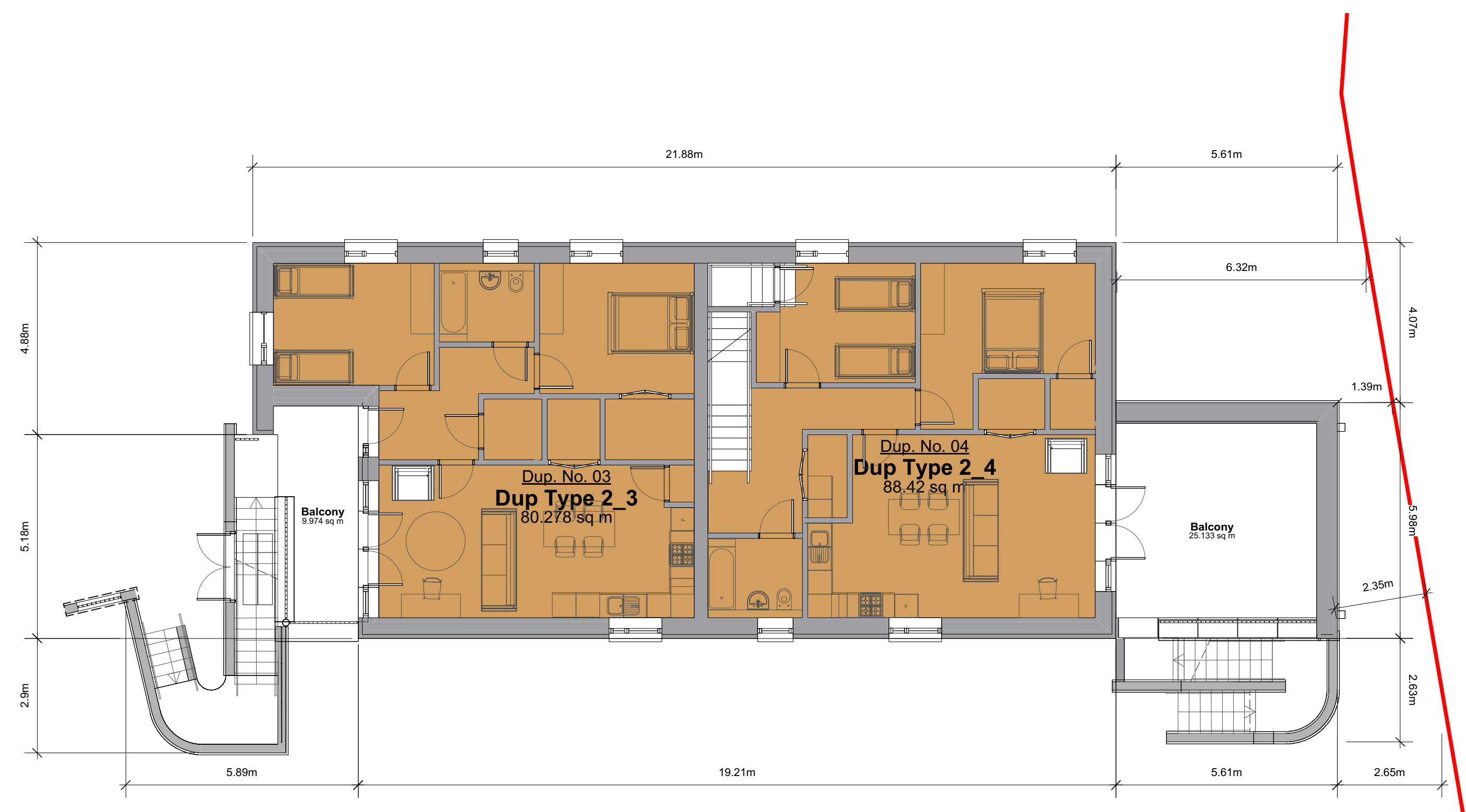
2 Floor Plan - Level +1 Scale: 1:100