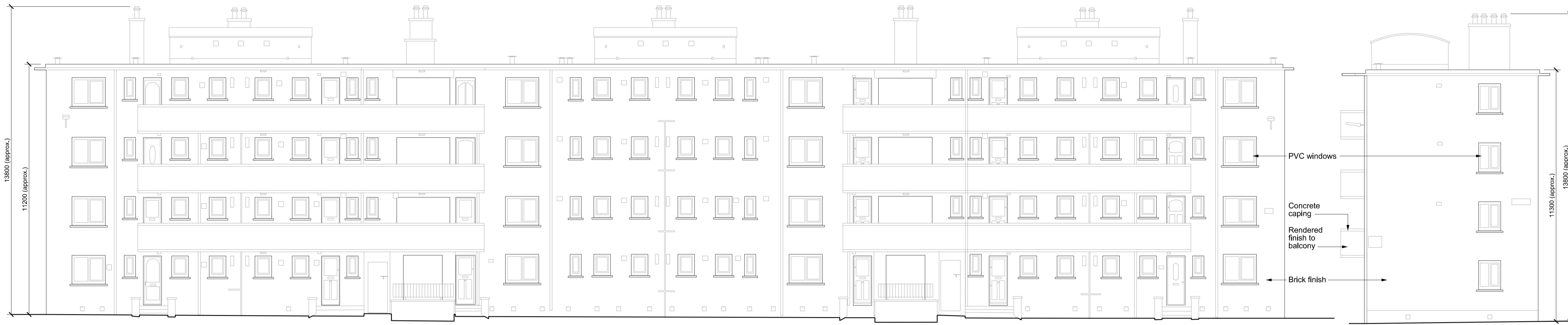
EXISTING NORTH ELEVATION - BLOCKS 69-80 & 81-92 (Scale 1:100 & A1)

IMPORTANT 1 DO NOT SCALE FROM THIS DRAWING. 2 WORK ONLY FROM FIGURED DIMENSIONS. 3 ALL ERRORS & OMISSIONS TO BE REPORTED TO THE ARCHITECT. 4 THIS DRAWING IS TO BE READ IN CONJUNCTION WITH ALL OTHER DRAWINGS