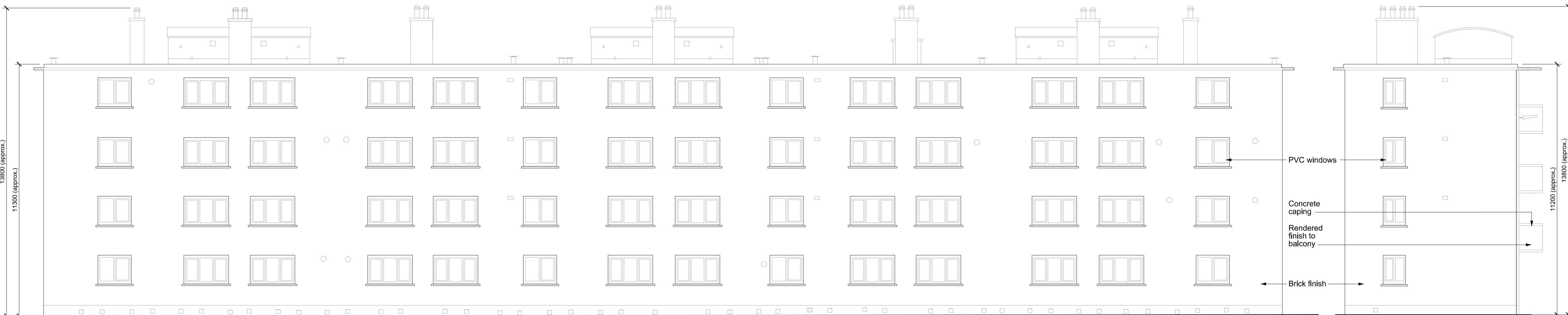
EXISTING SOUTH ELEVATION - BLOCKS 45-56 & 57-68 (Scale 1:100 & A1)