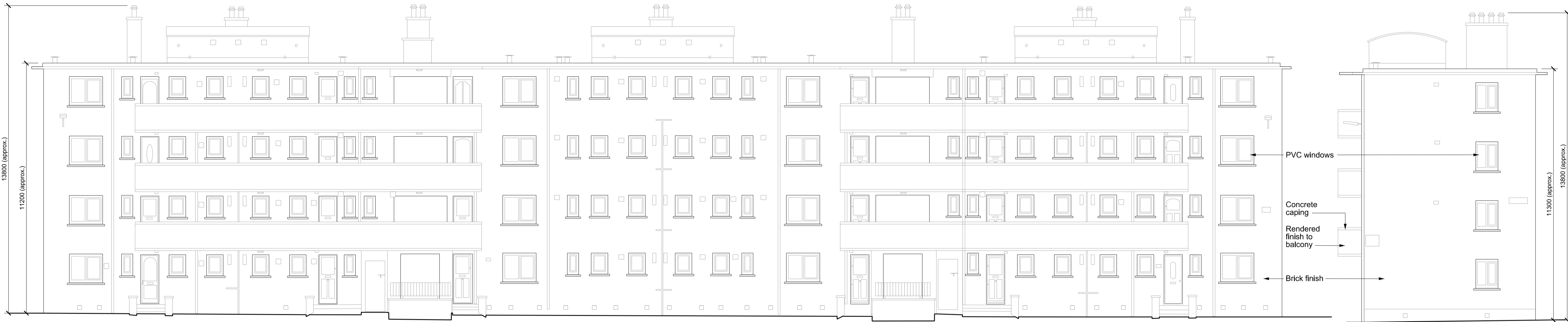
EXISTING NORTH ELEVATION - BLOCKS 45-56 & 57-68 (Scale 1:100 & A1)