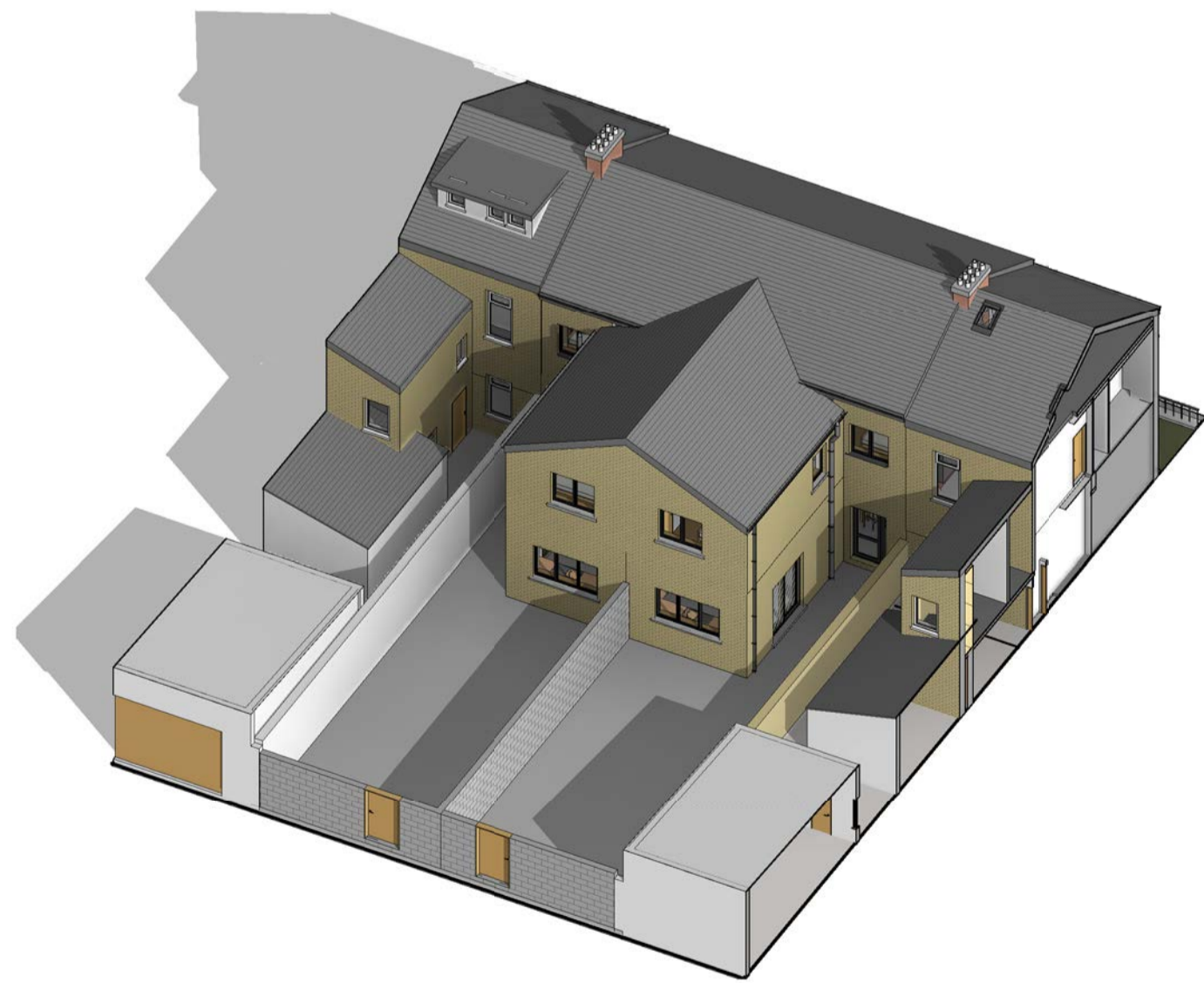
PROPOSED - SPRING EQUINOX - 11.00