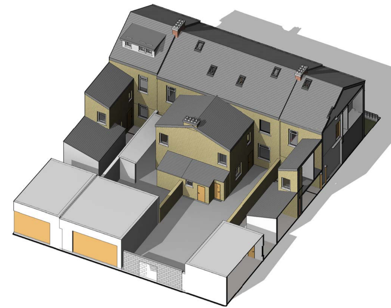
EXISTING - AUTUMN EQUINOX - 15.00