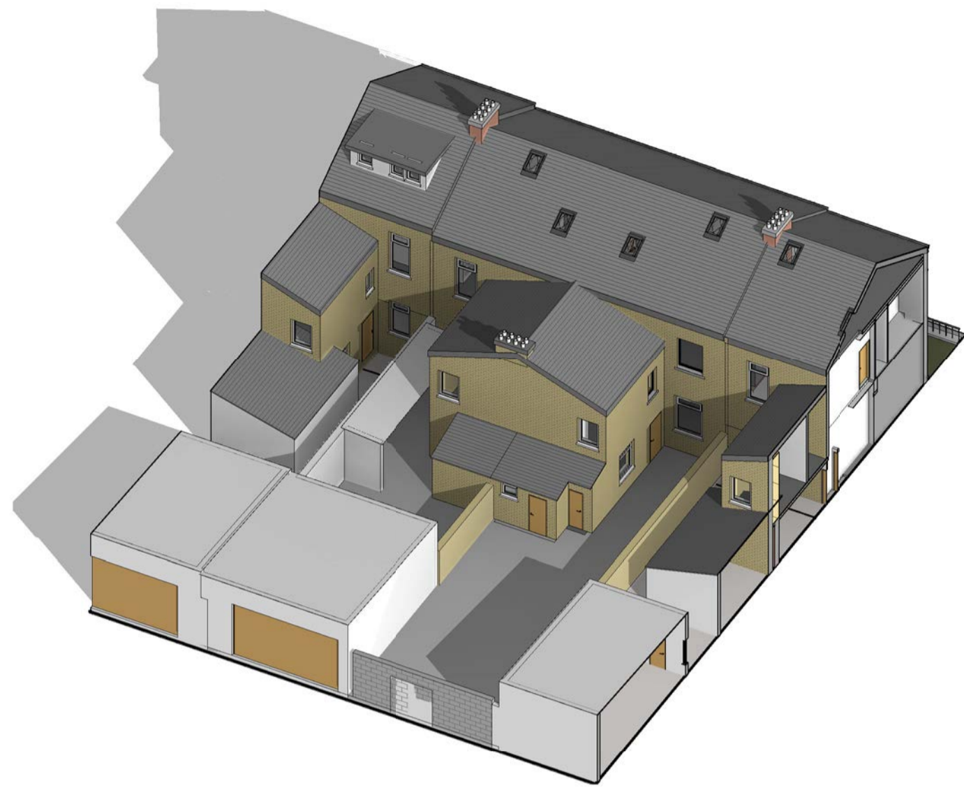
EXISTING - SPRING EQUINOX - 11.00