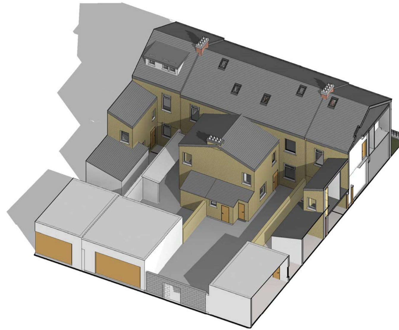
EXISTING - AUTUMN EQUINOX - 11.00