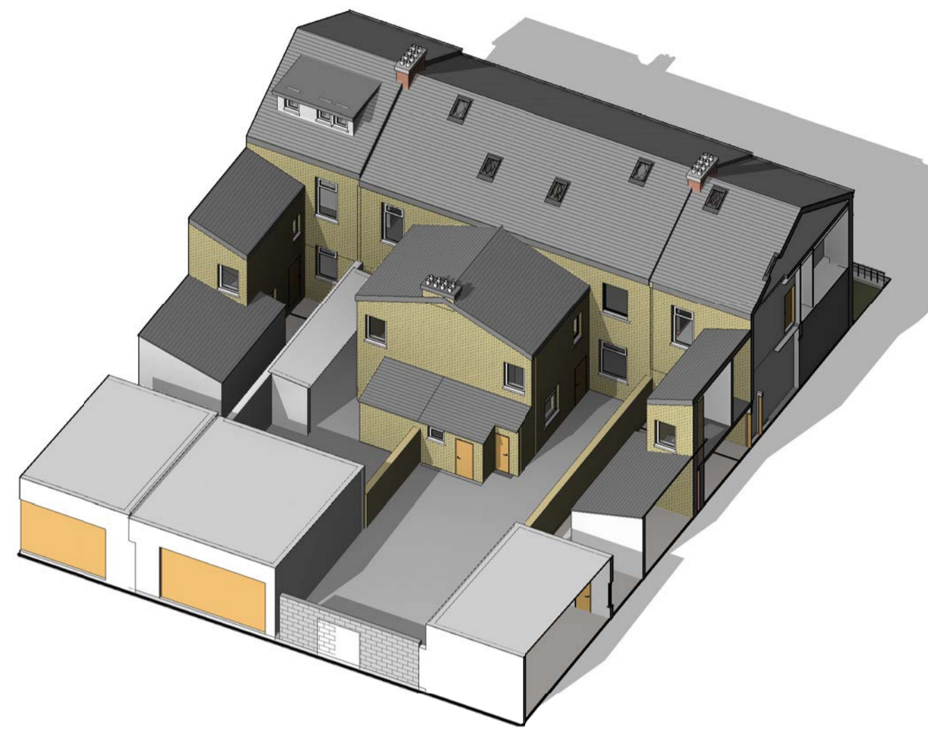
EXISTING - SPRING EQUINOX - 15.00