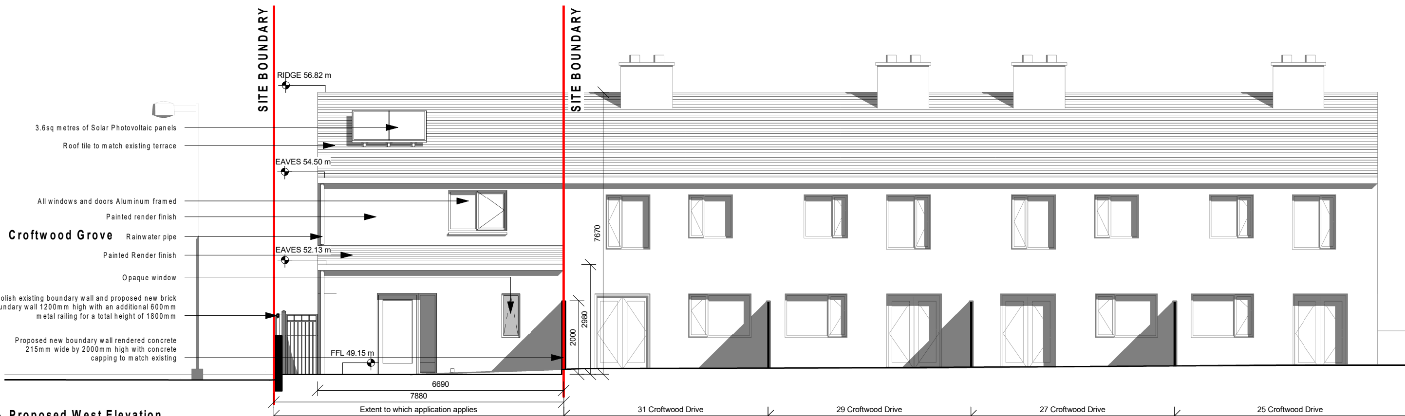
A Proposed West Elevation 1 : 100