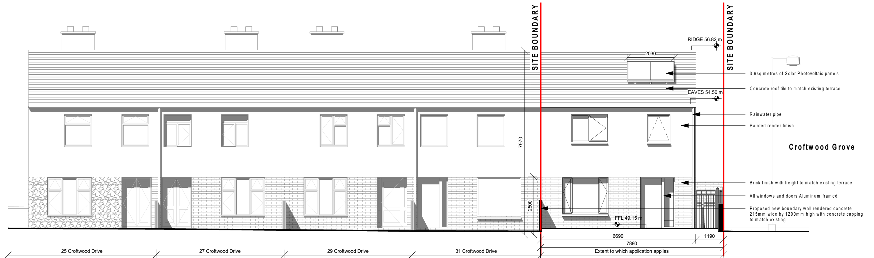
1 Proposed East Elevation 1 : 100