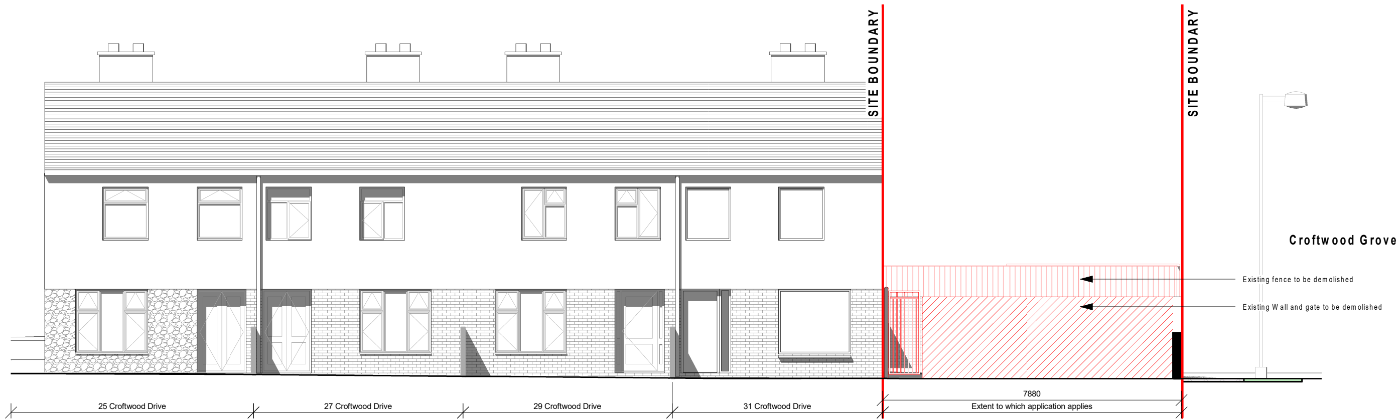
2 Existing East Elevation 1 : 100