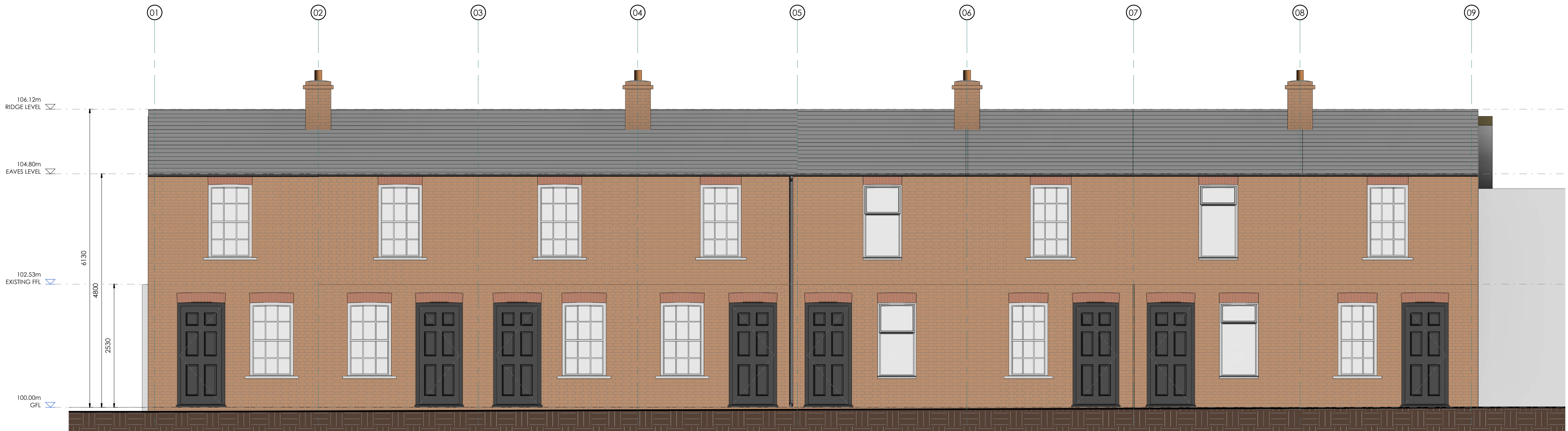
EXISTING SOUTHEAST ELEVATION (P) 1 : 50

1 THE MAIN CONTRACTOR, SUB-CONTRACTOR OR SUPPLIER SHALL: