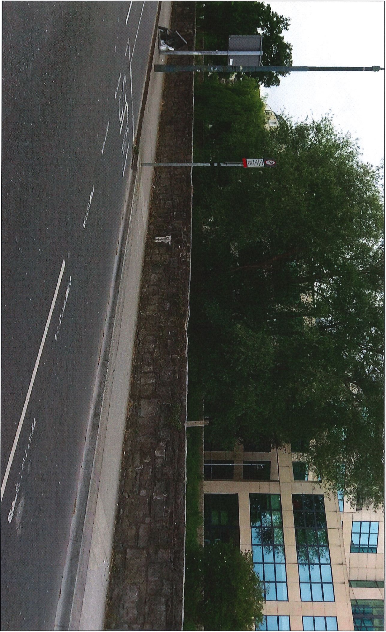
Figure: 1.6.1 View from Anglesea Road looking upstream Rev: 00 BSM View 6 As Existing Brady Shipman March Built 1989 Environment.