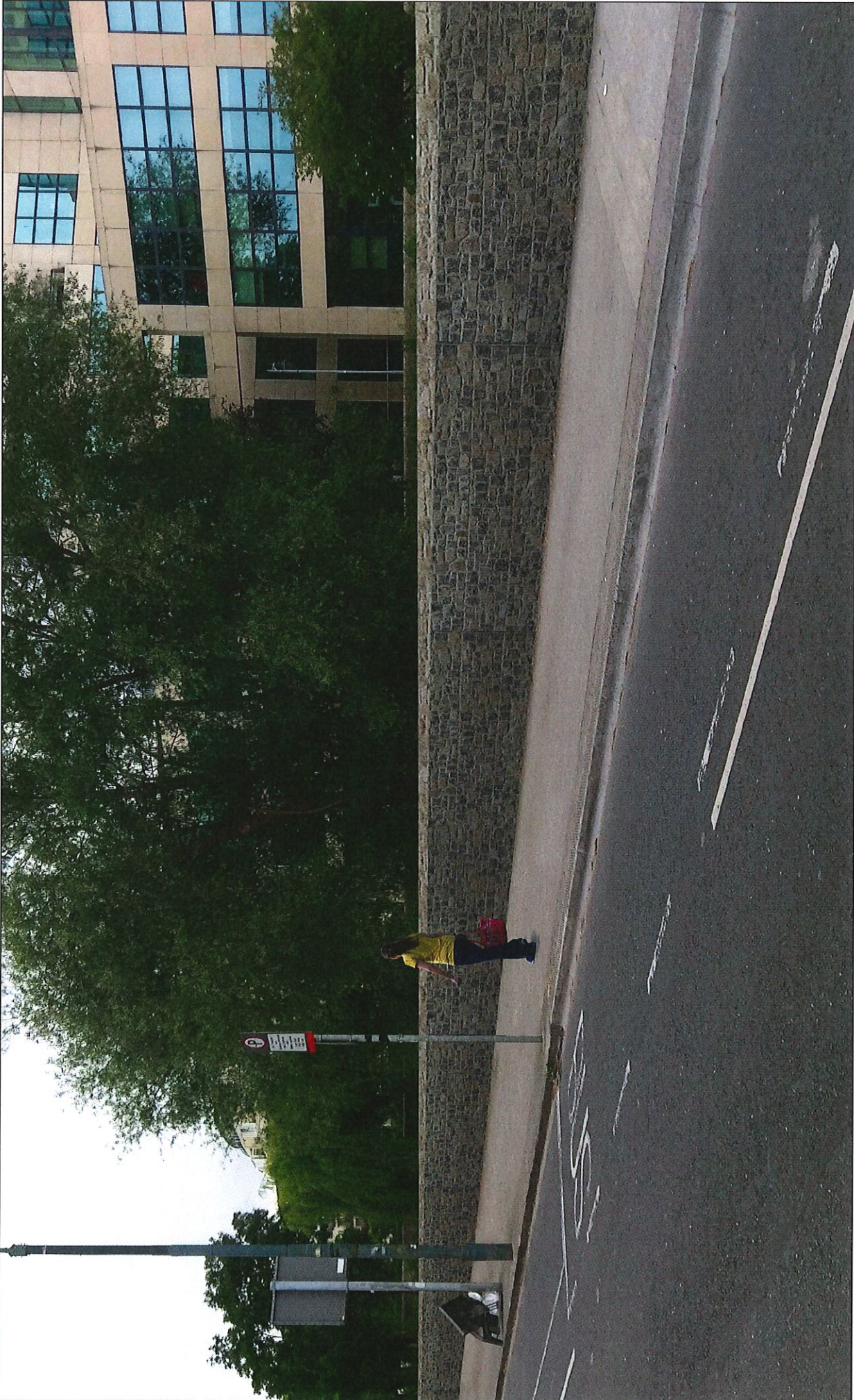
Figure: 1.6.2 Rev: 00 BSM Brady Shipman View 6 As Proposed Martin. View from Angelsea Road looking upstream Built: Environment. 1st 13th