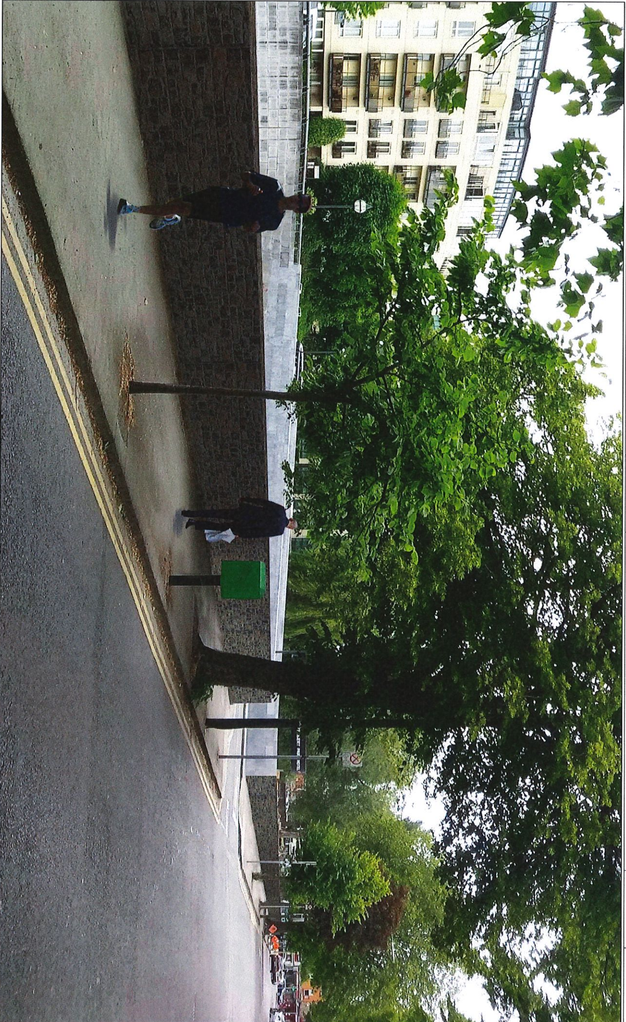
Figure: 1.5.2 Rev: 00 BSM View 5 As Proposed Brady Shipman View from Anglessea Road looking towards Ballsbridge Built Environment