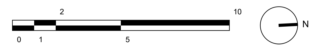
1 Hardscape Floor Plan-Zone 01 1 : 100