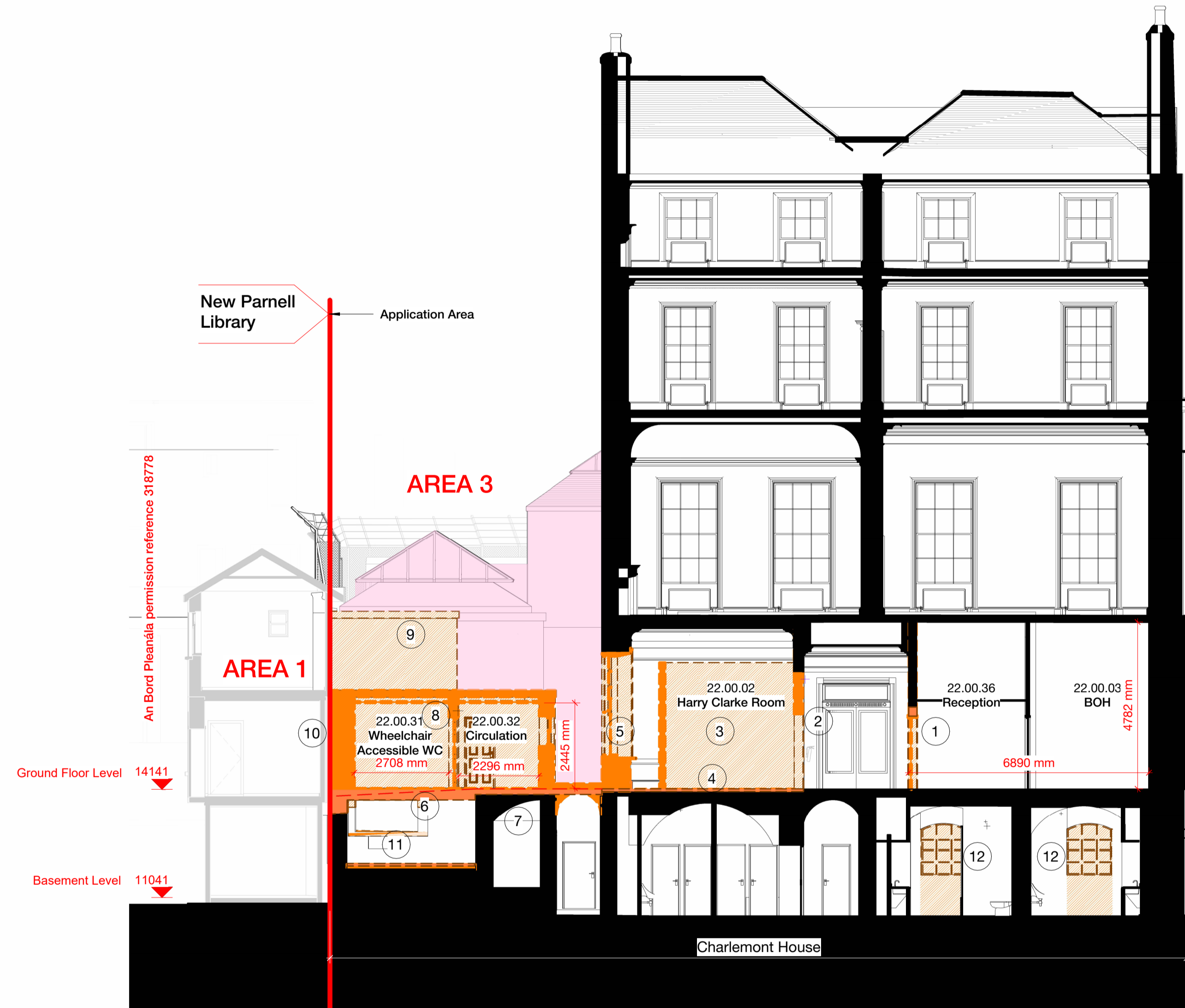
Existing & Fabric Removal - Section G-G 1 : 100

Note: This is an additional drawing to previously consented set