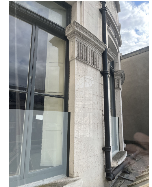
CGI / COLLAGE OF PROPOSED GLAZED FR GUARDRAIL TO WINDOW W1-08