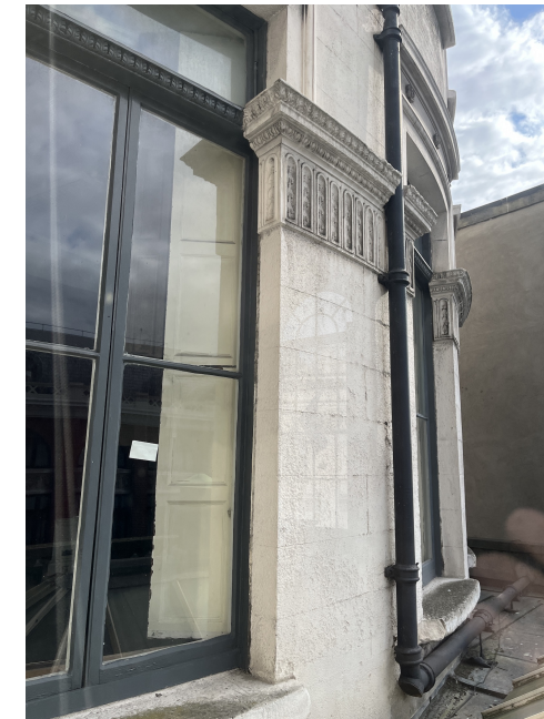
EXISTING WINDOW W1-08