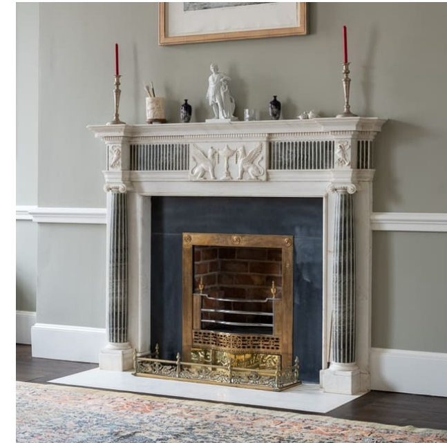
Example of the new grates to be inserted in the fireplaces without grates