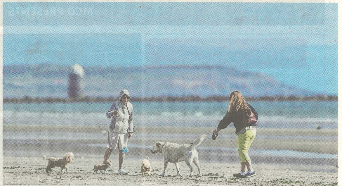
People walking their dogs at Bettystown Beach, Co Meath, which was awarded a Blue Flag.

A record 70 beaches were handed a Green Coast Award in recognition of