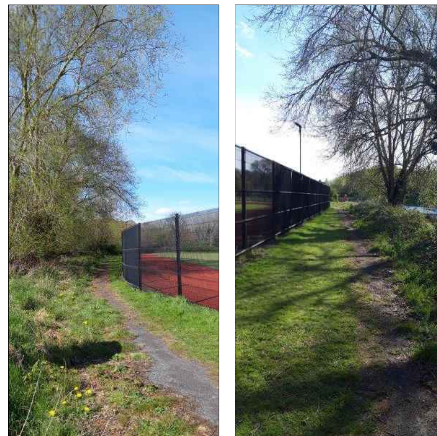
02 SOUTH BOUNDARY PHOTOGRAPHS SCALE: NTS