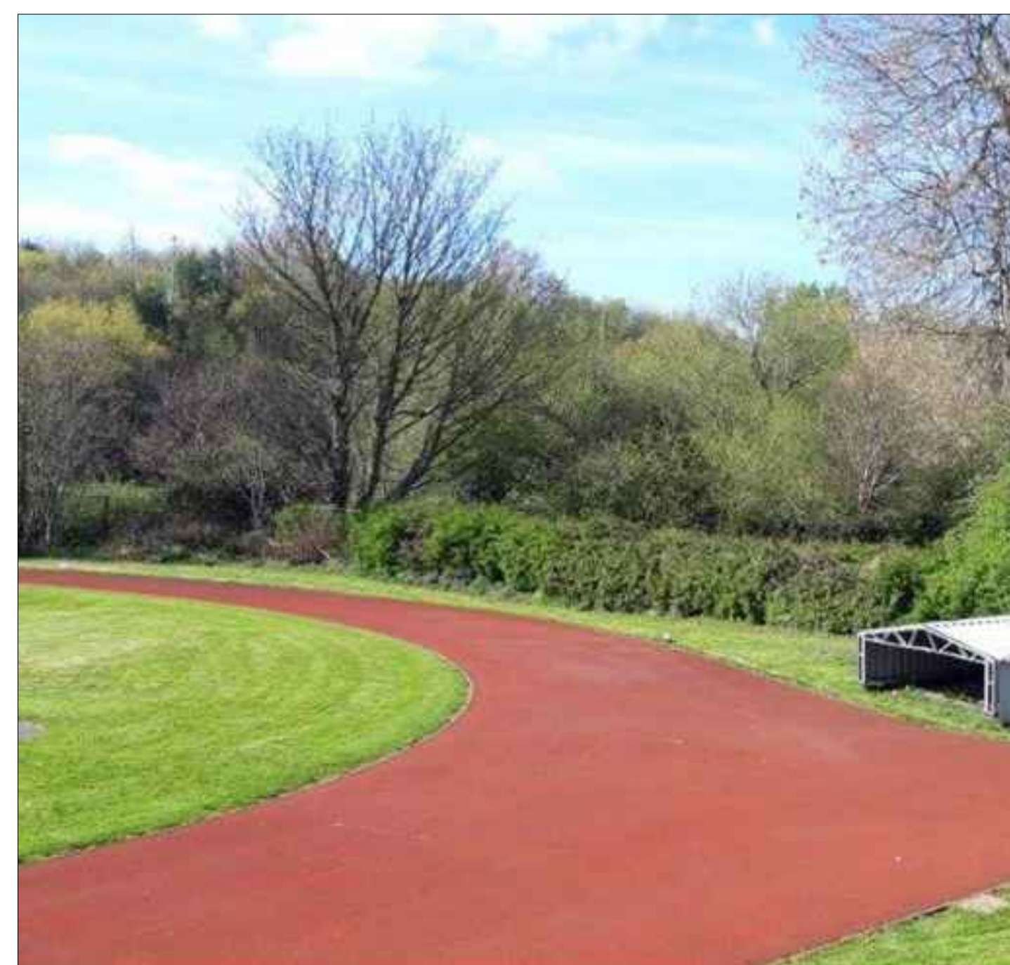
04 SITE PHOTOGRAPHS SCALE: NTS