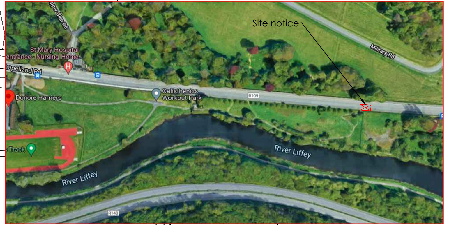
02 OFF SITE SITE NOTICE NTS